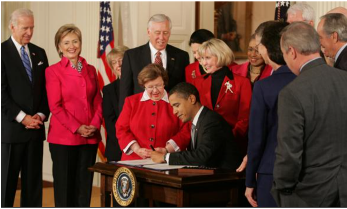
of President Obama signing the Lilly Ledbetter Act on January 29, 2009