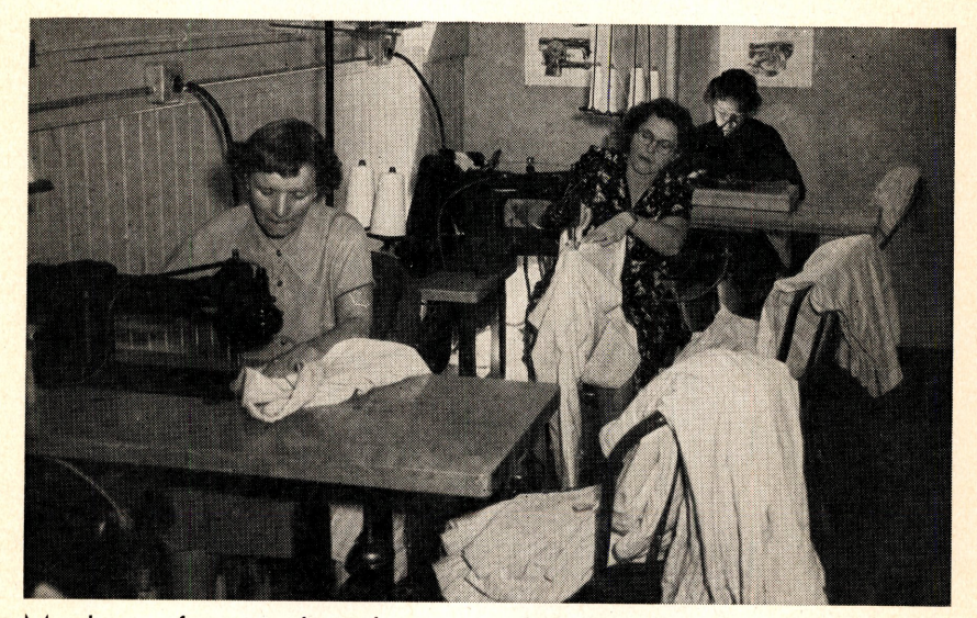
Members of an industrial sewing class concentrate on learning to operate power sewing machines at high speed.

At first, there was a shortage of applicants since the school did not have the financial resources to publicize the new course. This problem