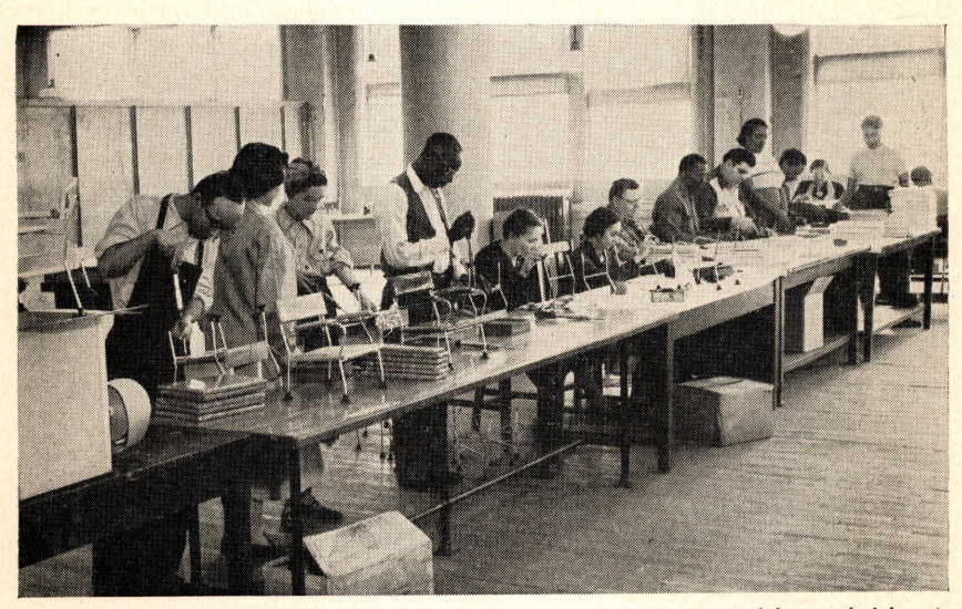
Trainees learn teamwork on the assembly line by assembling children's chairs.

The first project organized was an experiment in teaching good work habits and was known as the "industrial training service." This has steadily expanded until it now accommodates 600 trainees learning a variety of relatively unskilled jobs such as soldering, assembling, pack-