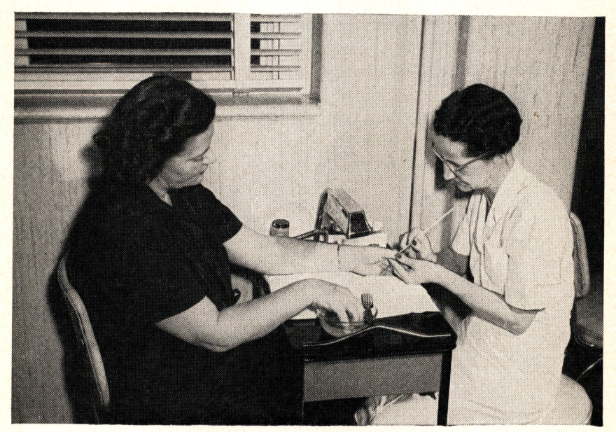
A cosmetology student practices on a "customer."

Classes are scheduled for 8 hours a day, 5 days a week, and are held during the daytime except for a supplementary course on sales techniques given at night for a 6-week period. Each day begins with 1 hour of theory in which students are taught a limited amount of anatomy, physiology, and chemistry. Students spend the rest of the morning on station, receiving instruction and practicing on one another. In the afternoon, the trainees practice on customers who have regular appointments at the school and are charged only the cost of supplies. Weekly tests in theory are given; time records on practical operations are kept for each student; and the final examination is patterned after that of the State board of cosmetology. The intensive nature and high standards of the course are shown by the fact that, since the course began 14 years ago, only one student who took the State examination failed to pass.