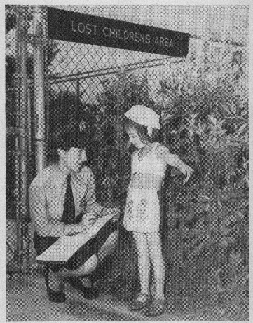
Figure 7.—Policewoman questioning lost child.

cities reporting, more than half required only a high-school education or its equivalent for police of both sexes (13). However, educational requirements for State policewomen in Connecticut in 1949 included as one option, graduation from college and 1 year of employment in probation, parole, penological, social, group, or law-enforcement work or as a nurse, teacher, or investigator. Without college graduation, not less than 5 years'