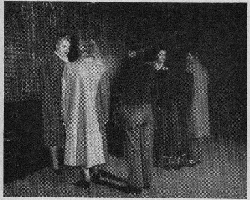
Figure 2.—Policewomen questioning minors outside a tap room they may be legally forbidden to enter.