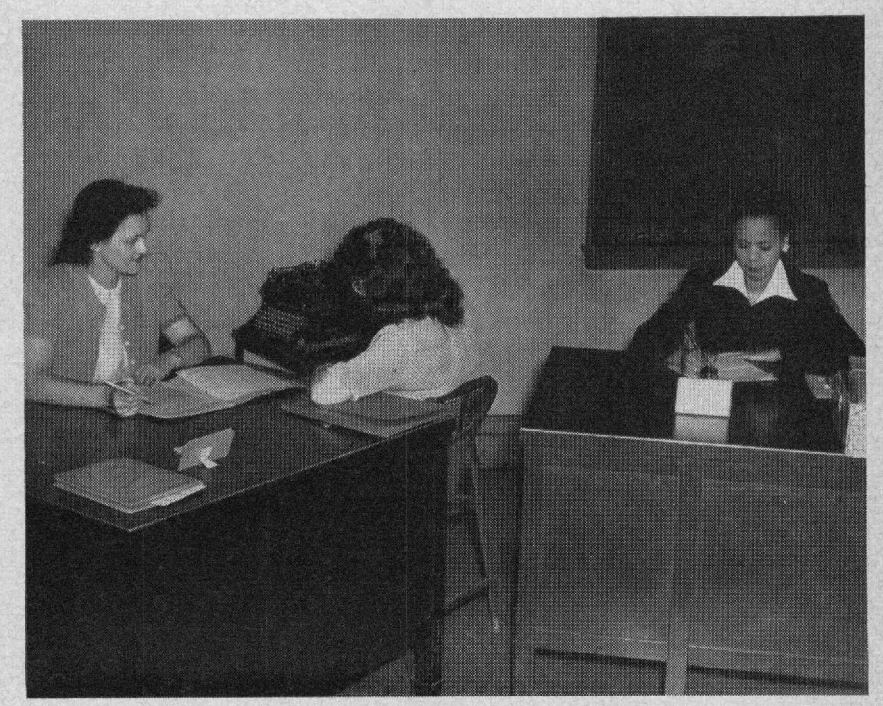
Figure 3.—Policewoman checking details for court case.

In many localities women are also employed as bailiffs, to take women into and out of courtrooms when their cases are called; to accompany in a similar capacity children who must necessarily appear in court without their parents; and sometimes to transport and care for women jurors held for jury trial.