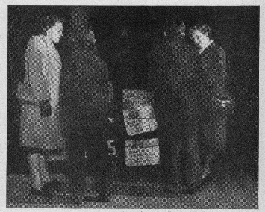
Figure 1.—Policewomen questioning ages of newsboys.

In the larger cities, policewomen usually have alternating assignments in which they may serve as: court worker, who submits to court a report of investigations in all cases of women and accompanies to and from court those not on bond; missing persons worker, who makes necessary investigations of women and children reported missing; patrol worker, assigned to inspection of movies and legitimate theaters and to supervision in public parks, dance halls, cabarets and night clubs; patrol worker assigned to investigation and detection of shoplifting; traffic officer, who guards school children at crossings near schools; license officer, who investigates applications for licenses for dance halls, tap rooms, massage establishments, fortune tellers, and public halls;