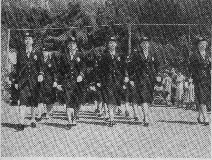
Figure 8.—Policewomen class marching at graduation exercises.

services when injury, accident, or illness results from the job. In practically all of the States, workmen's compensation laws cover State employees in whole or in part (17).