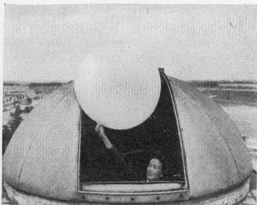
Meteorological aid releasing a pilot balloon to make observations of winds aloft.