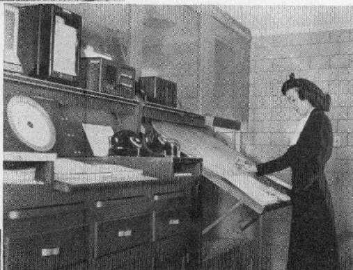
Meteorological aid coding message of winds aloft for teletype communication.