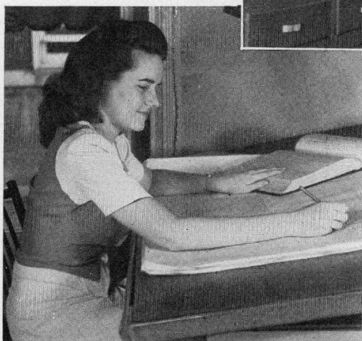
Meteorologist analyzing charts to prepare material for forecasters in training.