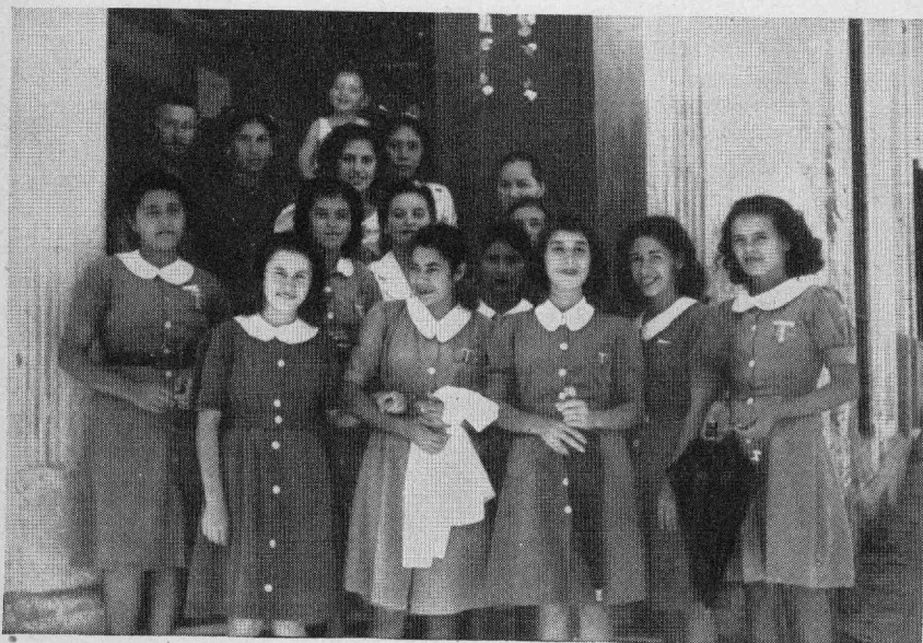
WORKERS IN KNIT-GOODS SHOP

There is a diversity of smaller establishments for canning fruits, preserves, and fruit juices and for manufacturing shoes and leather goods, cigarettes, matches, perfume, soap, furniture, and general woodwork. The output of these factories goes into the domestic market almost exclusively.