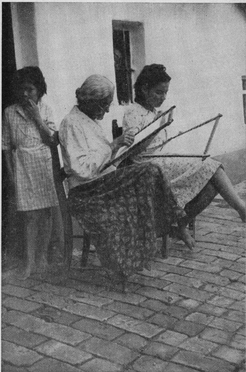
ÑANDUTÍ LACE MAKERS IN THE VILLAGE OF ITAGUÁ