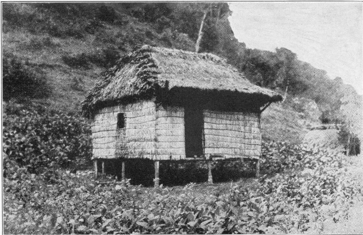
TYPICAL NATIVE HUT.