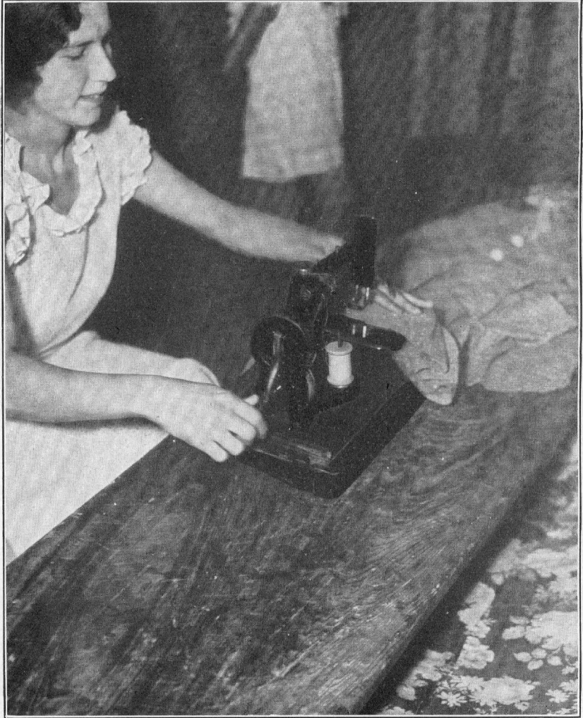
SEWING WITH A HAND MACHINE ON A BOARD LAID ON THE BED. WORKER SITS ON A BOX, WITH KNEES AGAINST THE BED.