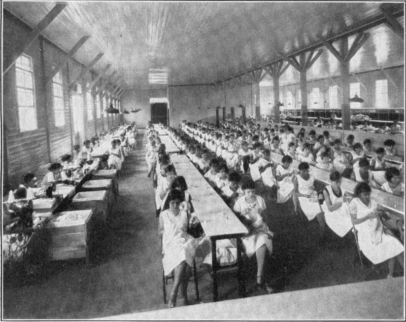
HOME-WORK PROCESSES AS DONE IN A FACTORY.