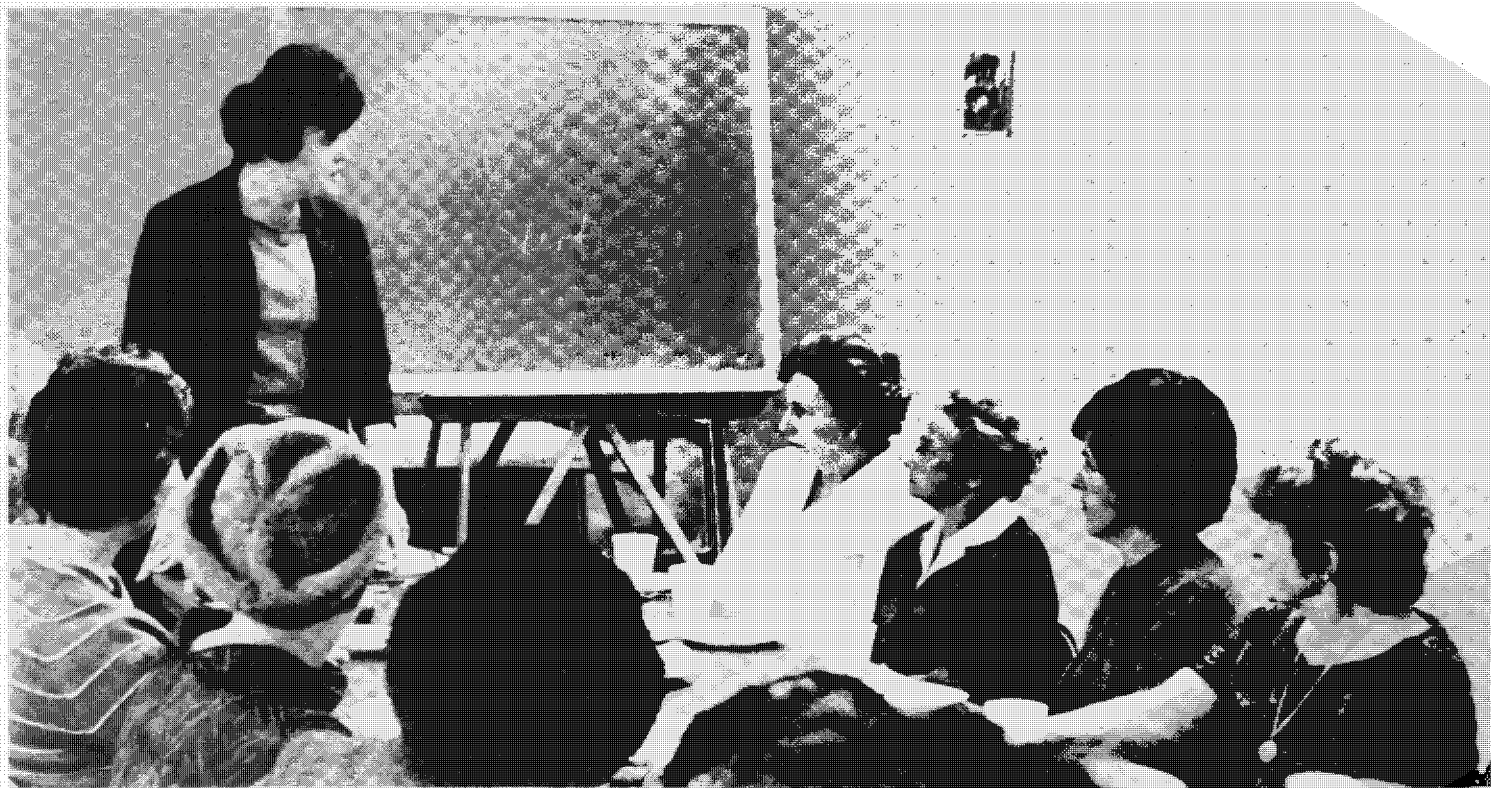
When home and family responsibilities lessen, women at all educational levels find they have time to resume formal education.