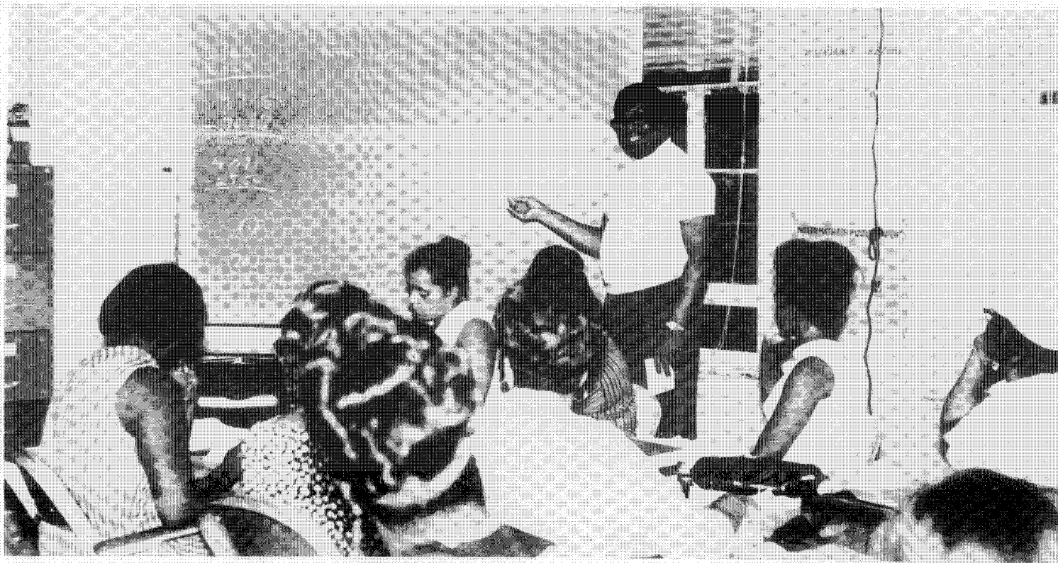
Supportive services offered with some training programs include basic education, testing, counseling, and placement assistance.