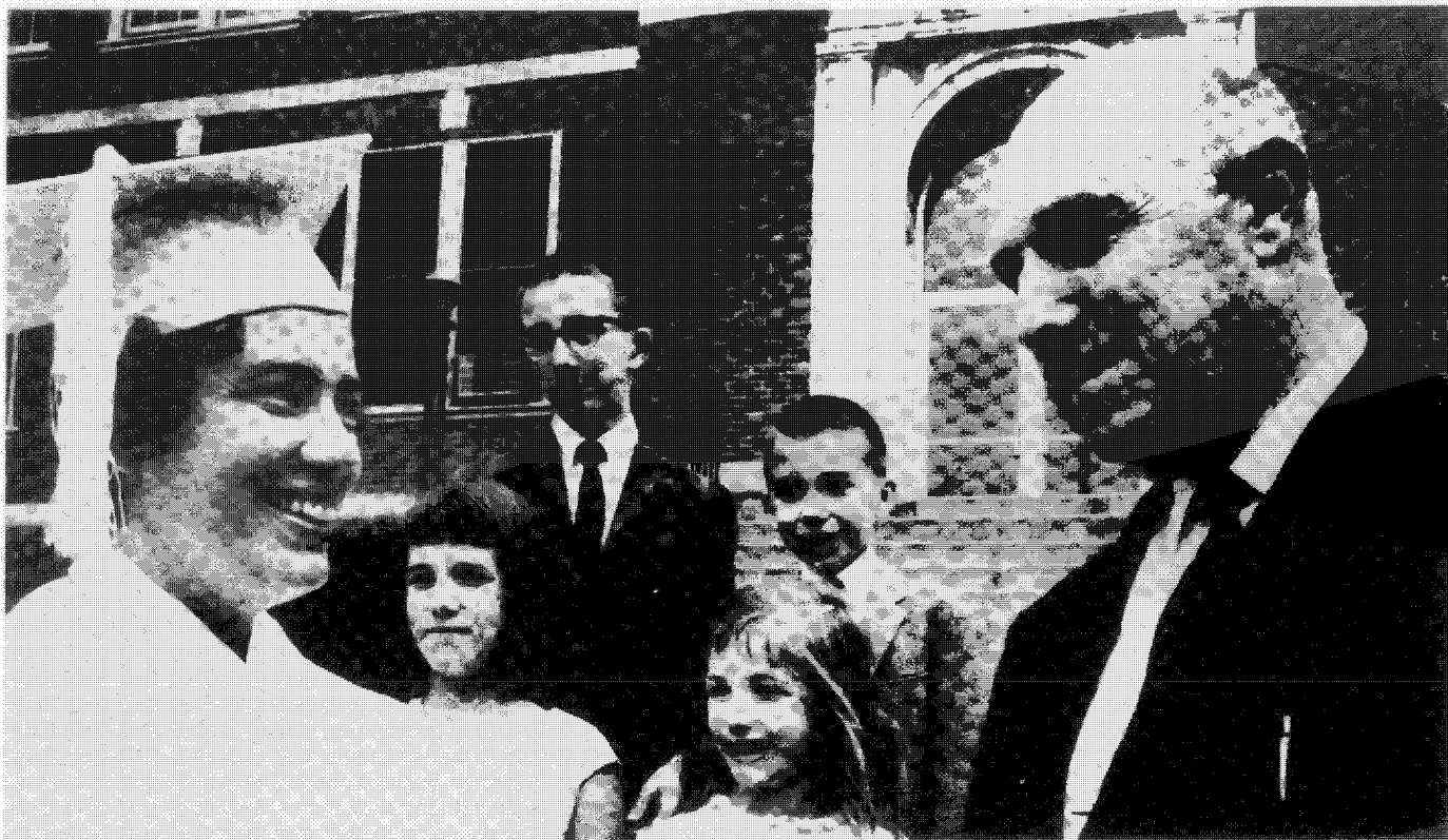
Many women today are completing a high school or college education with their children's approval.