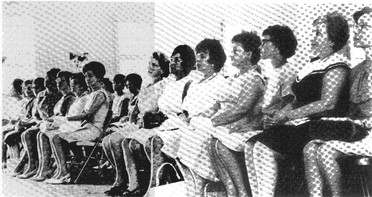
Graduation exercises mark the end of the first step toward return to work or to other activities outside the home.