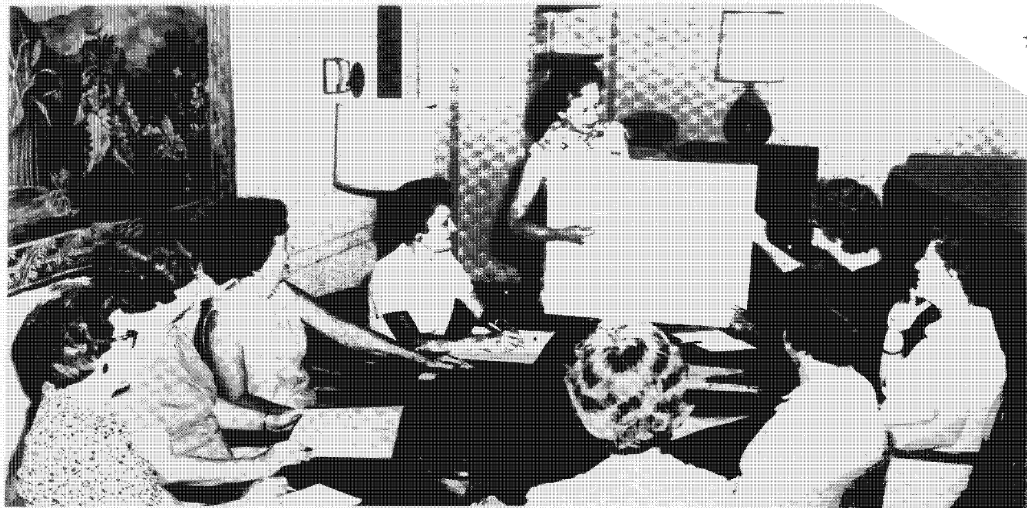
In a workshop for counselors of adult women, participants discuss such topics as the sociological and psychological aspects of work, total life planning, testing procedures, part-time employment opportunities, and practical considerations relating to women's employment.