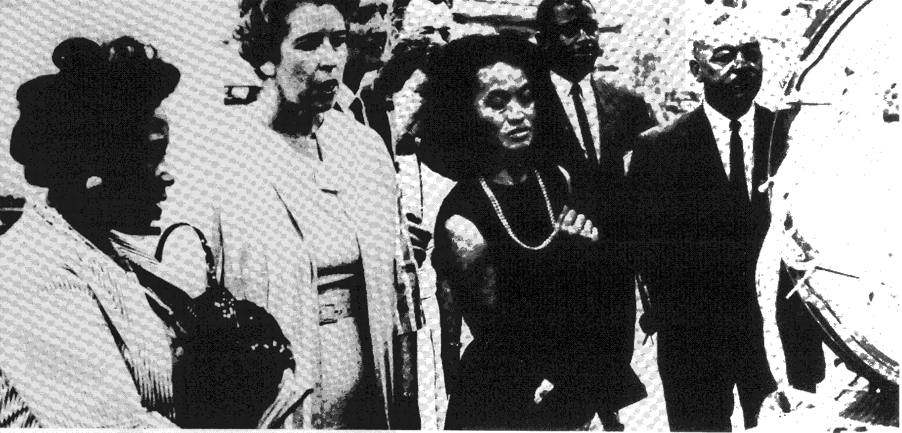
A factory tour by vocational counselors can increase their understanding of the variety of jobs for which women and girls might be trained.