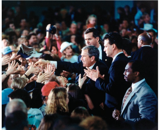
The President with Secret Service protection at a public speaking engagement.

Protecting our Nation's Leaders. The U.S. Secret Service performs two critical Homeland Security missions: protection of the Nation's leaders and investigation of financial and electronic crimes. The Domestic Protectees program, which was found to be highly effective in the most recent Program Assessment Rating Tool (PART) assessment, is responsible for the protection of the President and Vice President of the United States and their families, former Presidents and their spouses, and other designated individuals. The investigation program focuses on ensuring the integrity of the Nation's financial and electronic infrastructure. The Budget includes a total of $1.3 billion for the Secret Service to provide continued support for its protection and investigation programs, $65 million higher than the 2006 enacted level, and includes $18 million to begin protection preparations for the next presidential campaign.