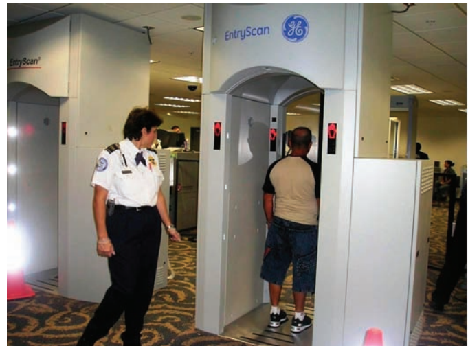
Passengers at Miami International Airport are screened by emerging technology at the security checkpoint. Passengers stand in the trace portal for a few seconds while several puffs of air are released. The machine then analyzes the air for traces of explosives and alerts screeners if explosives are detected.

The 2007 Budget proposes to replace the two-tiered aviation passenger security fee schedule with a single flat security fee of $5.00 for a one-way trip. The single fee corresponds better with actual security screening, which normally occurs only once in a one-way trip regardless of the number of trip segments. The new fee is expected to increase collections by an additional $1.3 billion, for a total of $3.3 billion. The revenue generated by aviation security fees will cover about 70 percent of core aviation security costs. Aligning costs to fees will improve the overall management of aviation screening by encouraging system managers to improve system efficiency. Requiring users to pay for aviation screening and security is what was intended by the Congress and will free up other homeland resources to be spent on needs that are more dispersed across the general population.