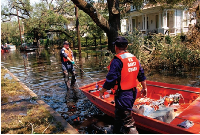
A Coast Guard search and rescue crew from a St. Louis, Missouri, based Disaster Area Response Team drags their skiff to a launching point on South Carrollton Avenue in New Orleans, Louisiana, to look for people in distress.

Securing the National Capital Region's Air Defenses. The Budget for the Coast Guard also includes $61 million for the establishment of a permanent National Capital Region Air Defense program. Previously, this activity was carried out by temporarily-assigned helicopter units from Customs and Border Protection (CBP). Upon transfer of the function to the Coast Guard, the service will establish a new helicopter wing at Coast Guard Air Station Atlantic City, and units will be deployed to Washington, D.C., to enforce the National Capital Region no-fly zone, helping protect the capital from an air attack.