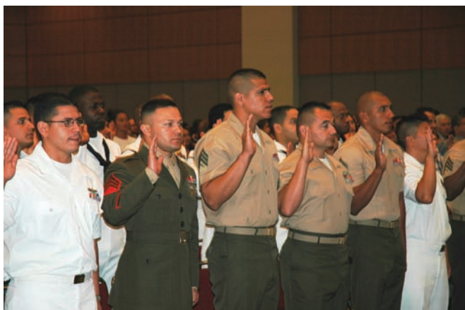
American soldiers take the oath of citizenship at a military naturalization ceremony.

The close of 2006 will mark the end of the President's five-year goal and $560 million initiative to achieve a six-month processing standard for immigration applications. At the end of 2005, the backlog had fallen by over 2.5 million cases (from a high of 3.8 million in January 2004). Automation of operations will maintain and improve upon this standard and prevent new backlogs from developing.