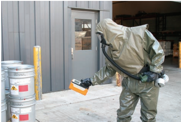
Customs and Border Protection works with the Domestic Nuclear Detection Office to deploy the latest nuclear detection technology.

Ensuring Seamless Overseas and Domestic Nuclear Detection. The new Domestic Nuclear Detection Office (DNDO) was created last year within DHS to coordinate the Nation's nuclear detection efforts. The 2007 Budget includes $536 million for DNDO, a 70-percent increase from the 2006 level. Together with the Departments of State, Energy, Defense, and Justice, DNDO will develop and deploy a comprehensive system to detect and report any attempt to import, assemble, or transport a nuclear device and fissile or radiological materials within the United States.