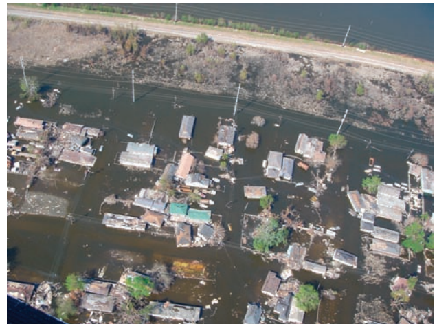
New Orleans, Louisiana, on September 27, 2005, after Hurricane Katrina caused flooding.

To date, more than $80 billion in assistance has been made available for response and recovery efforts for Hurricane Katrina. In order to increase oversight of Katrina-related spending and to reduce waste, fraud, and abuse, the DHS Inspector General received $15 million in supplemental funds, and an additional $11 million is proposed in the Budget to continue these audit, investigation, and oversight activities. DHS also established a Katrina Internal Controls and Procurement Oversight Board