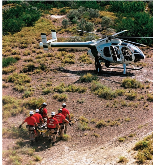
Border Patrol BORSTAR team members work together with pilots from an air unit to evacuate a patient to safety.

Secretary Chertoff’s goal is to end the practice of “catch and release” and detain and remove these aliens as quickly as possible from the country. To meet this commitment, the Budget provides funding to add more than 6,000 new detention beds to hold illegal immigrants while they await removal. This will bring the total number of beds available to approximately 27,500. DHS will also improve the processing and deportation of aliens to cut the detention time for aliens approximately in half—from 30 days to 15 days.