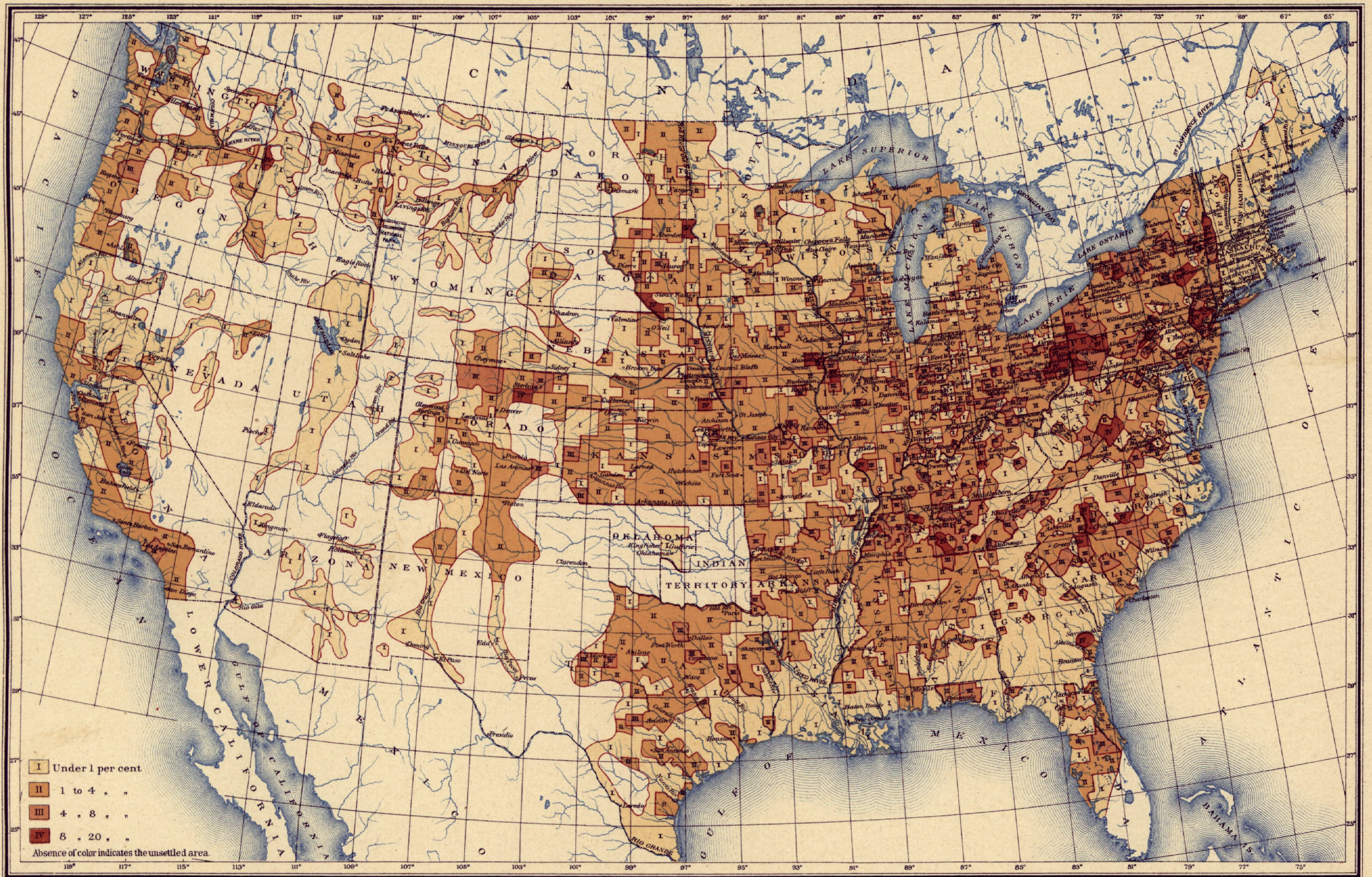
160. PROPORTION OF THE CONGREGATIONALISTS TO THE AGGREGATE POPULATION : 1890.