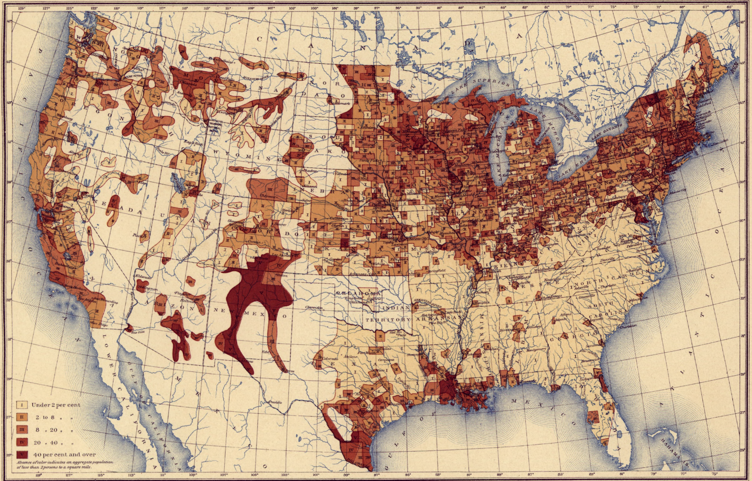
156. PROPORTION OF THE METHODISTS TO THE AGGREGATE POPULATION : 1890.