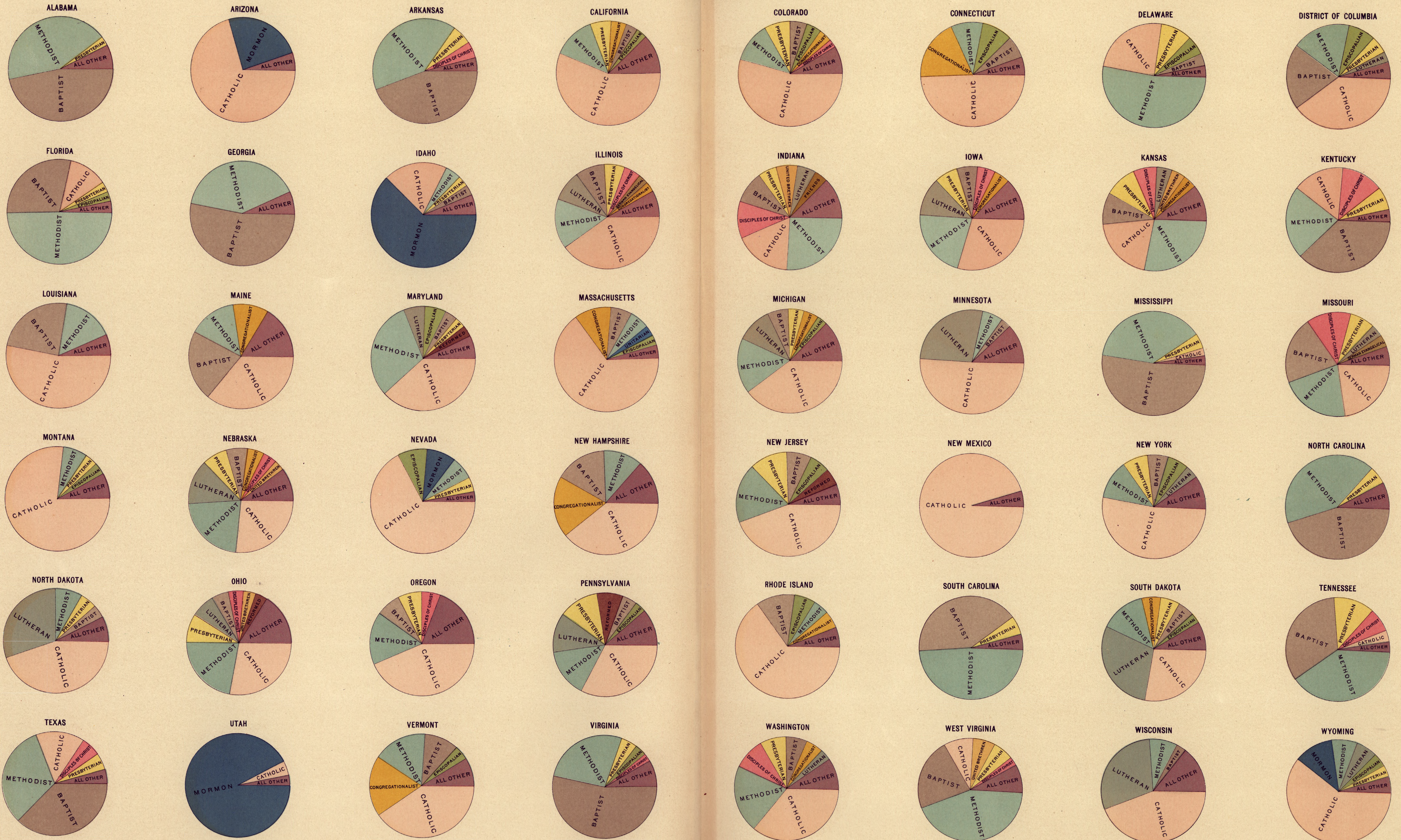
THE AREA OF THE CIRCLE REPRESENTS IN EACH CASE THE ENTIRE CHURCH MEMBERSHIP. THE VARIOUS SECTORS REPRESENT, PROPORTIONALLY, THE STRENGTH OF EACH DENOMINATION.