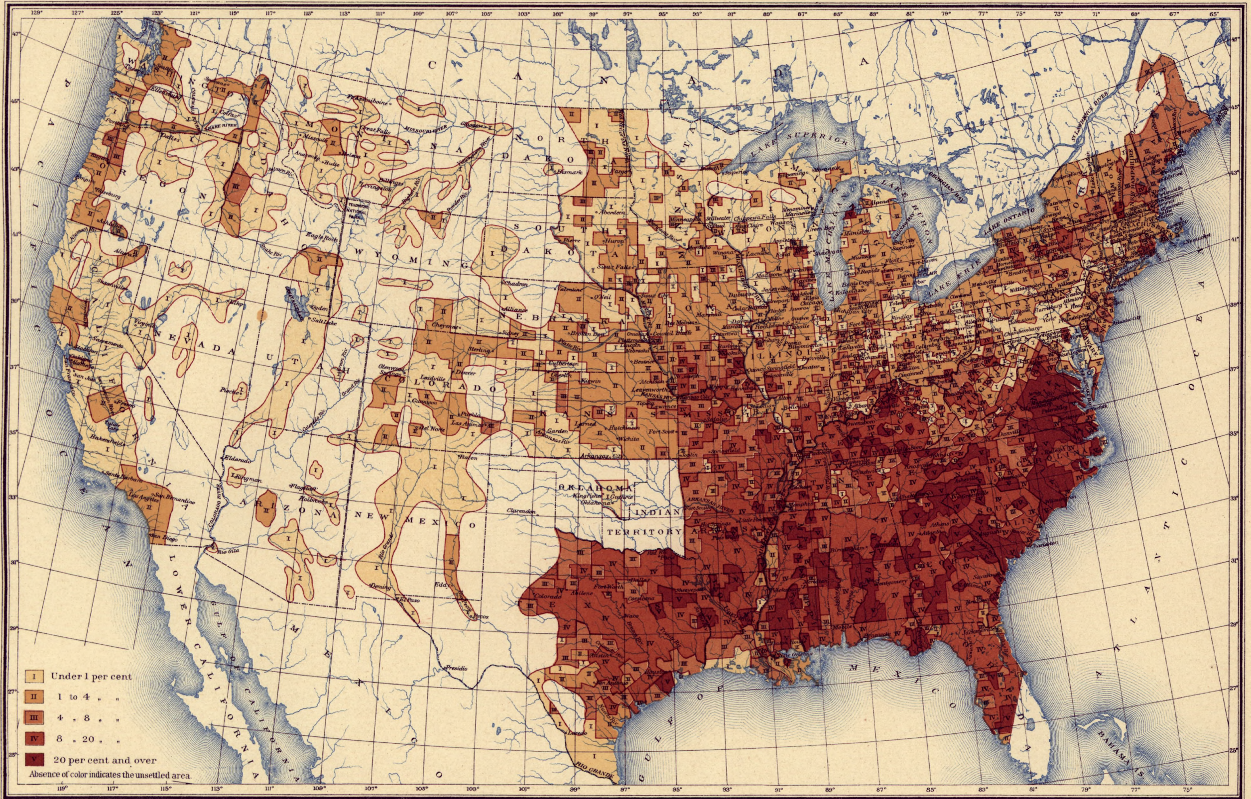
158. PROPORTION OF THE LUTHERANS TO THE AGGREGATE POPULATION : 1890.