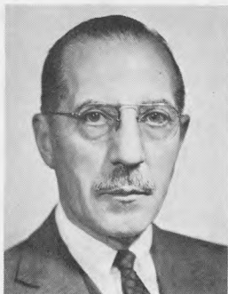
R. E. TOOL