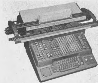
Models: 31 — 32 — 33 — 35