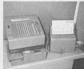
Model 41 — with change dispenser

Up to nine separate totals Add and subtract counter Two separate batch totals "Built-In" adding machine feature Automatic change computation and dispensing Expedites flow of work to proof department Eliminates listing and recapping (from $750 to $1,495)