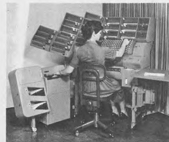
Models: 123 — 125 — 127

Simplifies and speeds work at window and proof department Mechanically proves every transaction Guarantees accuracy Reduces detail work Up to 20 separate totals and tapes May be wired for MICR encoding of amounts 1/3 of original cost