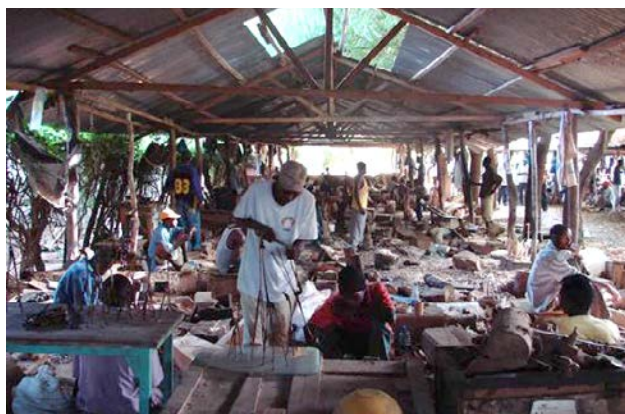
Malindi Handicrafts, Malindi, Kenya.

>> More Have You Heard content is available online www.stlouisfed.org/publications/bridges