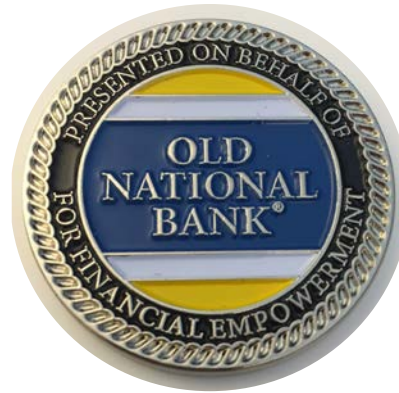
ONB completion coin awarded at graduation.

Program graduates ultimately return to their communities with far greater self-esteem and financial confidence, making them more likely to open a bank account, save for college, create an emergency fund and purchase a home. The program is cost-effective and sustainable. This particular at-risk population is very underserved; the risk (and cost) of reincarceration can be substantially