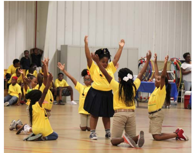
Indianola Promise Community and Sunflower County Consolidated School District Kids' Showcase: As part of IPC Week, students from Carver Elementary participate by demonstrating dance, music and athletics.

DHA, also located in the rural Mississippi Delta, is the umbrella organization for IPC. DHA is a nonprofit, 501(c)(3) organization that seeks to change health care and education in the region by improving access to health services, promoting healthier lifestyles and expanding educational opportunities. DHA has been a leader in supporting and operating community-based clinics that serve as a medical home for patients;