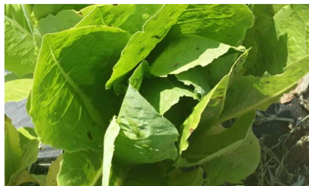
Fig. 1 (TOP): At Fresh Stops, each family receives a “share” of seasonal produce.