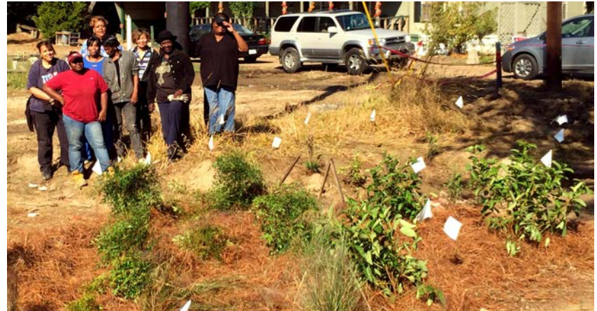
Fig. 3: The participants in the Ladies in the Landscape pilot project stand behind their newly completed storm-water management garden.

In Baptist Town, both my rational and idealist training have been called upon to develop a neighborhood community center. Defining what this center is—and all that both the neighborhood and the GLCEDF hope it can do—has required an idealist attitude from all parties involved. Pairing these hopes with a budget of only slightly more than $100,000, I have been