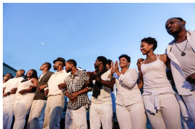
TOP: Young people from Smoketown participate in arts activities led by the Steam Exchange during the Smoketown Mobile Market organized by KSU’s Thorobred Nutrition Kitchen in Summer 2014.