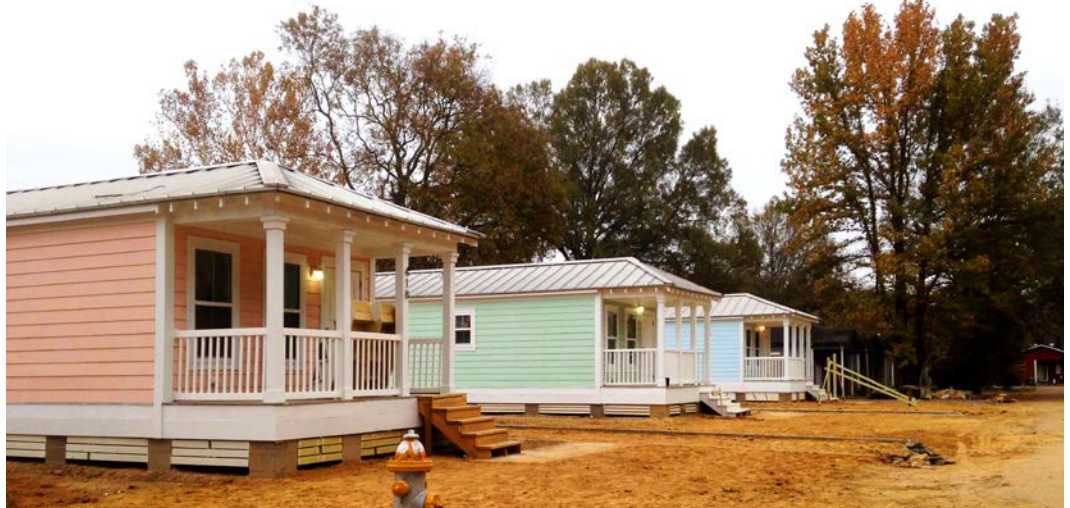
Fig. 1: Construction is nearing completion on an 11-unit affordable housing development in the Baptist Town neighborhood.