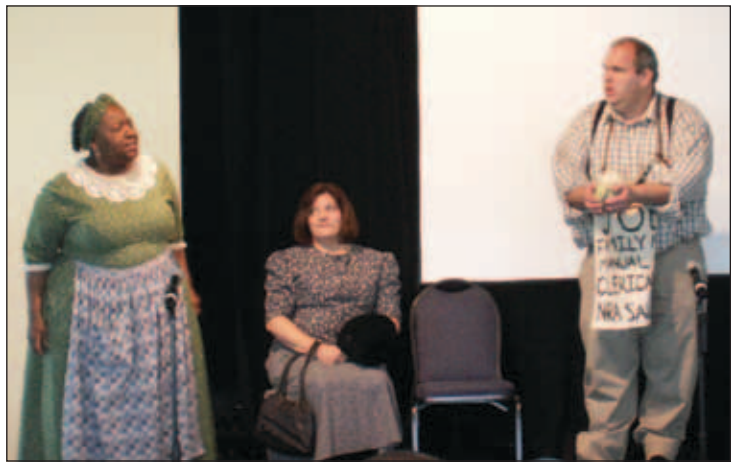
Several Swamp Gravy cast members traveled from Colquitt, Ga., to St. Louis to stage a short performance of the folk-life play.

By promoting economic development through the arts, Swamp Gravy has had a great impact in southwest Georgia. The Swamp Gravy Institute, an arts service organization, is an outgrowth of Swamp Gravy. The institute holds workshops on storytelling, gathering oral histories and helping other communities create their