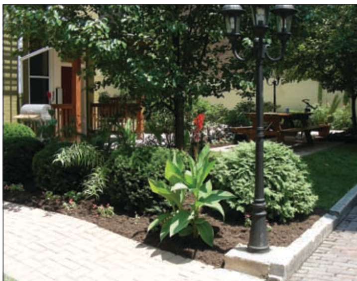
Landscaping at St. Anthony Village in the Over-the-Rhine neighborhood of Cincinnati is maintained by residents.

Over the last 20 years, Cornerstone has helped 30