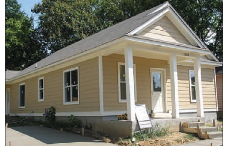
This new house is on the edge of the Cooper-Young neighborhood in Memphis, an area that has undergone a renaissance in the last 30 years.

Understanding the ingredients needed for success, the