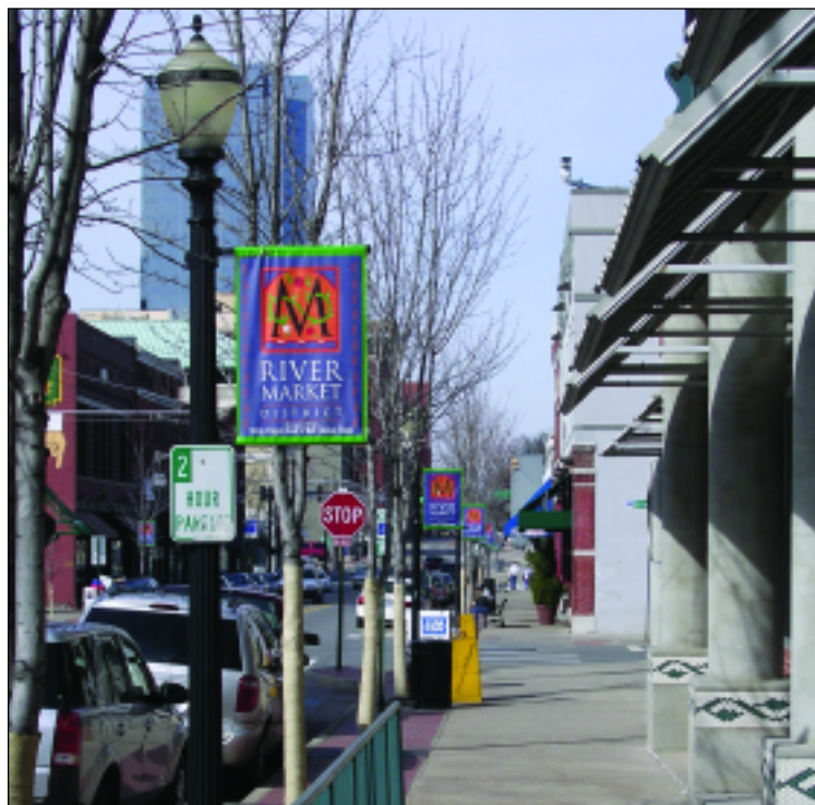
Little Rock's River Market District is located downtown along the Arkansas River.