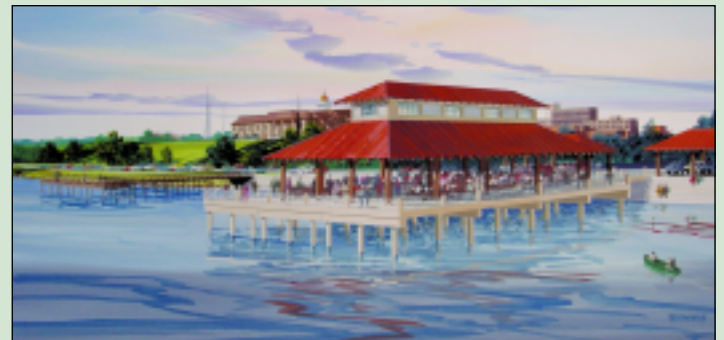
An artist's rendering of the proposed farmers' market pavilion at Lake Pine Bluff.

Phase I is scheduled to be completed by January, 2006. Plans for additional phases include a walking trail, a bike trail and a bridge to connect the lakefront area to the University of Arkansas at Pine Bluff campus.