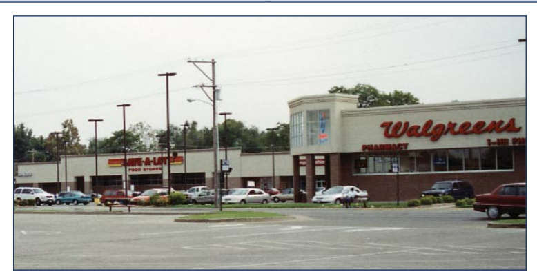
The State Street Shopping Center is at the core of a revitalized shopping district.

This complex of 174 townhomes for rent is located in East St. Louis' Emerson Park neighborhood. Adjacent to a MetroLink station and just blocks from the Jackie Joyner-Kersee Center, it is the first phase of more than 400 units of affordable rental and 100 units of forsale housing. The Emerson Park Development Corp. and McCormack Baron & Associates are partners on the development.