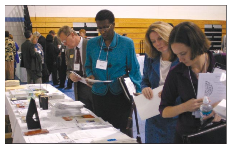
Conference participants pick up resource material.

Millions of dollars have been invested in programs to help