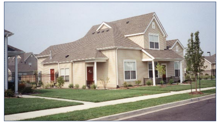
Parson's Place, with 174 townhomes, is located in the Emerson Park neighborhood.

East St. Louis and devastation became synonymous.