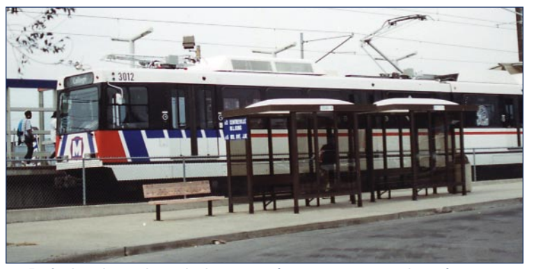
The 5th & Missouri MetroLink station is also a hub for buses and has a parking lot for commuters.