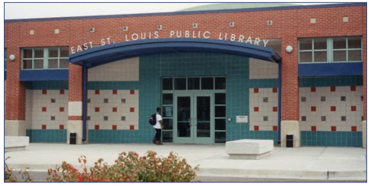
East St. Louis has a new public library at 5320 State St.