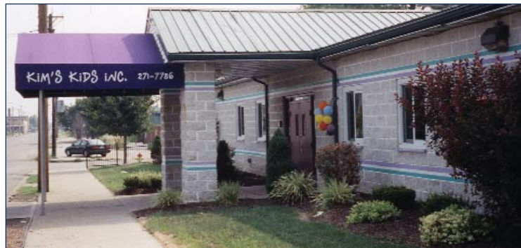
Kim's Kids, a 24-hour child-care center, opened in 1992 at 1000 Gaty Ave. and expanded to two buildings in 1997.

ing with him in 1990, they outlined what it would take for them to work with the university: