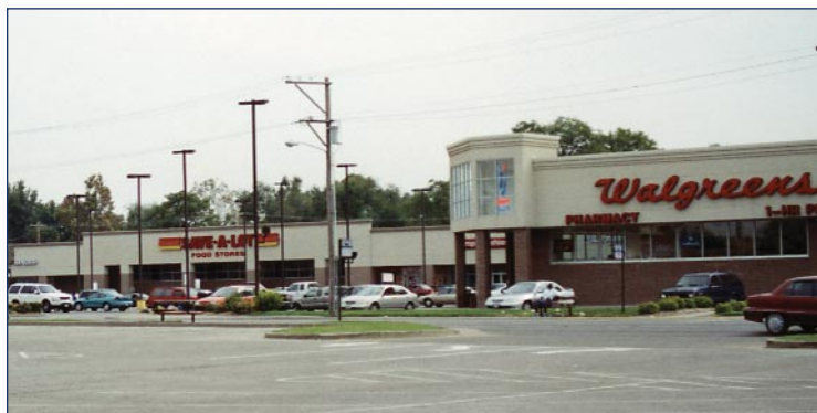
The State Street Shopping Center is at the core of a revitalized shopping district.

This complex of 174 townhomes for rent is located in East St. Louis' Emerson Park neighborhood. Adjacent to a MetroLink station and just blocks from the Jackie Joyner-Kersey Center, it is the first phase of more than 400 units of affordable rental and 100 units of for-sale housing. The Emerson Park Development Corp. and McCormack Baron & Associates are partners on the development.