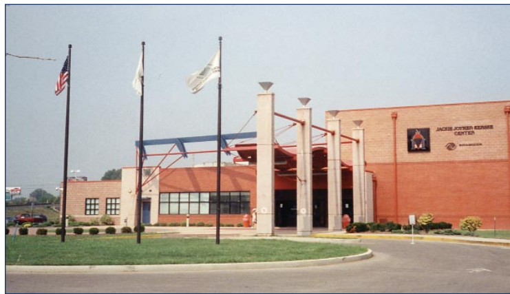
The Jackie Joyner-Kersey Center provides recreational and educational opportunities for youngsters from surrounding communities.