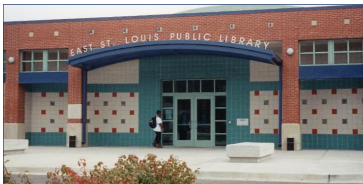
East St. Louis has a new public library at 5320 State St.