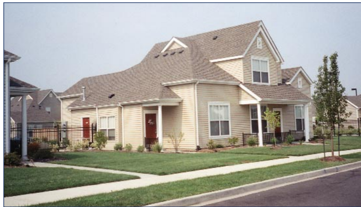
Parson's Place, with 174 townhomes, is located in the Emerson Park neighborhood.

East St. Louis and devastation became synonymous.