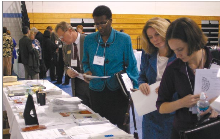
Conference participants pick up resource material.

Woodson recommends one important criterion for evaluating public policy on social and economic issues: “How does it affect the least of our society?”