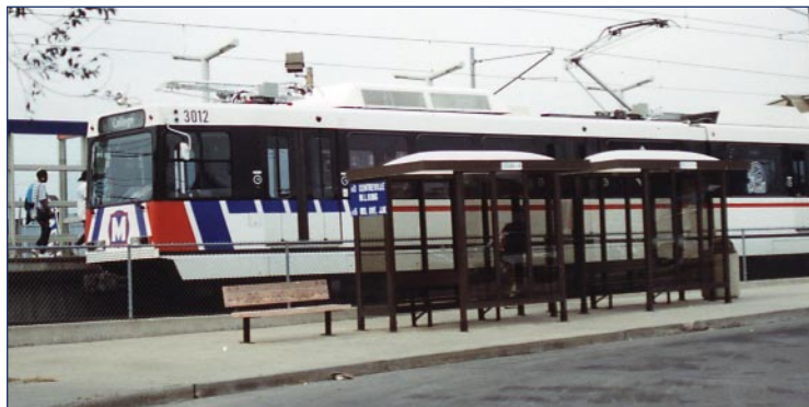
The 5th & Missouri MetroLink station is also a hub for buses and has a parking lot for commuters.