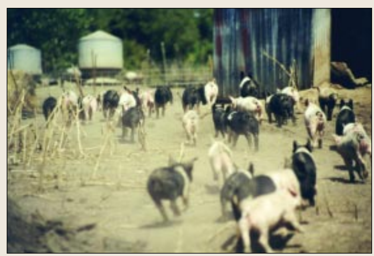
Pigs kick up the dust on a Patchwork farm.

The most devastating change was the growth of corporate hog farms, which were putting small hog operations out of business at a fast pace. MRCC had been formed in 1985 to address a