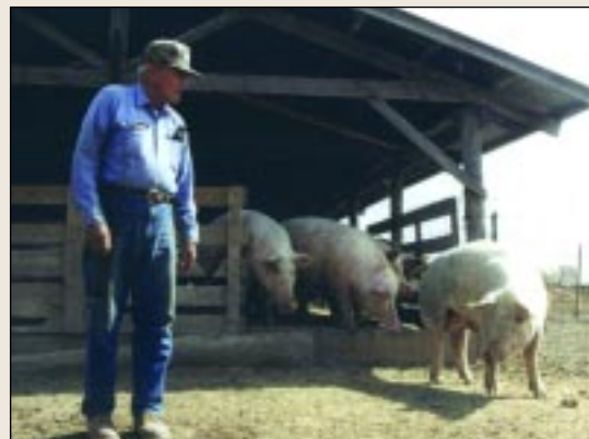
A Missouri farmer coaxes his hogs to come out in the sunshine.

In the 10 years since Patchwork Family Farms was started