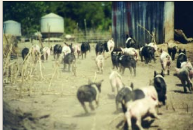
Pigs kick up the dust on a Patchwork farm.

The most devastating change was the growth of corporate hog farms, which were putting small hog operations out of business at a fast pace. MRCC had been formed in 1985 to address a