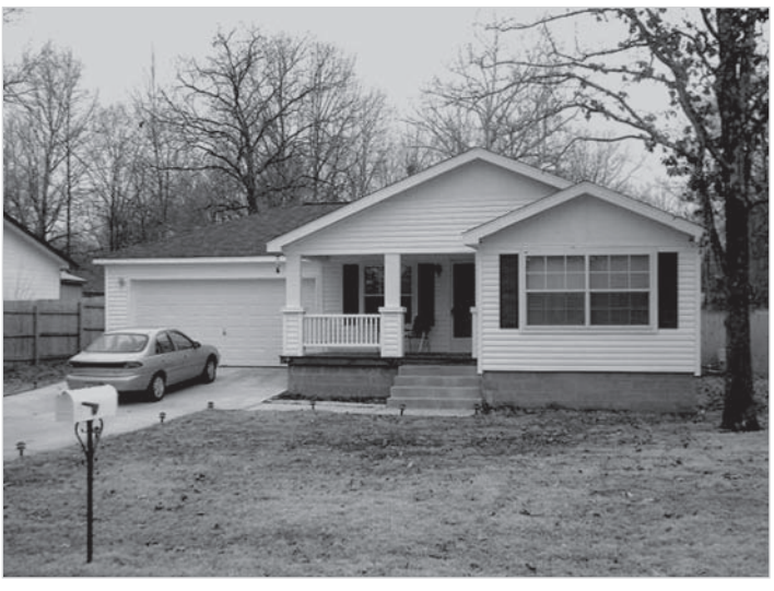
The city of Sherwood, Ark., successfully integrates manufactured homes, such as this one, with sitebuilt homes in a single-family, residential neighborhood.

However, the downturn in the industry came after years of good sales.