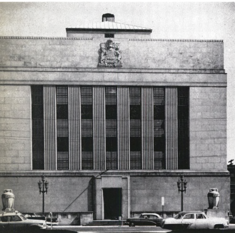
Top: left, Bank of Canada; center, State Bank of Pakistan; right, Banco Central de Venezuela

An astute observer of the American scene arrived at much the same conclusion: "It would not be tolerated to have a central bank . . . in the hands of private persons as distinguished from representatives of the people. The central bank is an instrument of