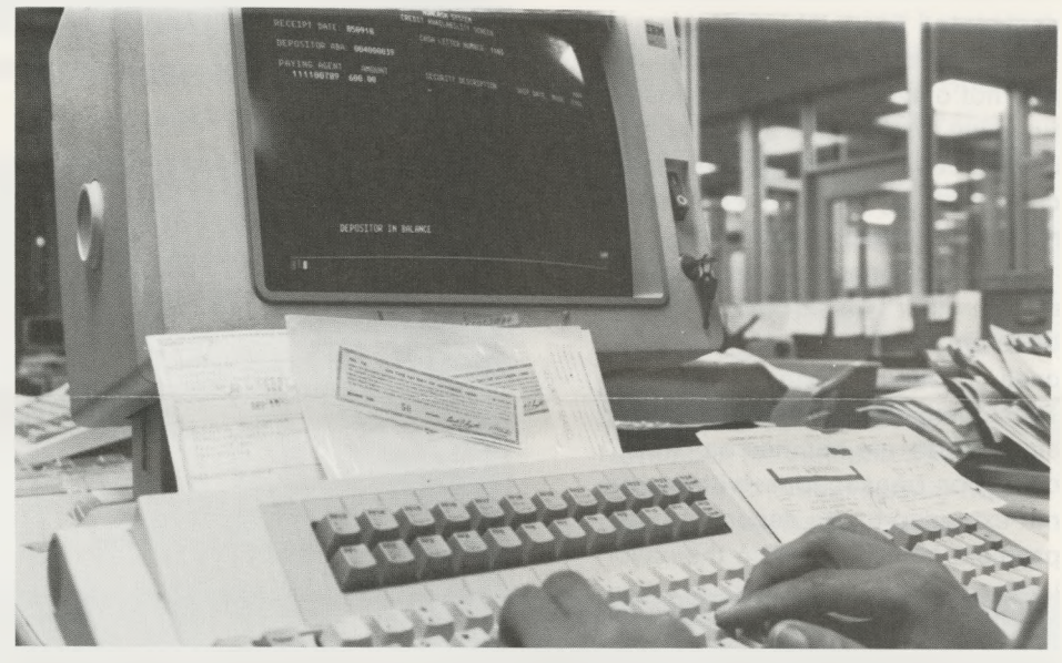
Operators enter coupon data into the terminal daily to balance and record cash letters. The Dallas Fed receives approximately 8000 coupons per month.

In the pre-TEFRA era, interest was represented by coupons attached to the bearer instrument. Those coupons were payable semi-annually and represented a dollar value to their