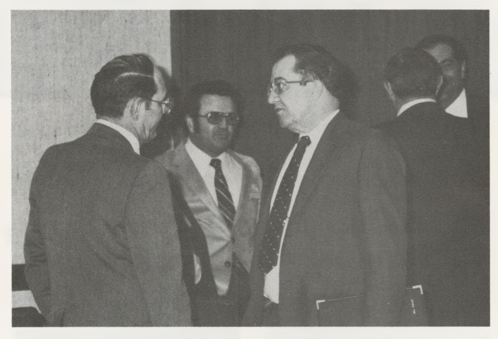
Committee members express their views on checks collection.

At their meeting, members were briefed on the new return item pilot program implemented February 24 and the effects that program will have on the pricing of checks services. They also discussed new proposals for interdistrict transportation of checks and the elimination of float from the system.