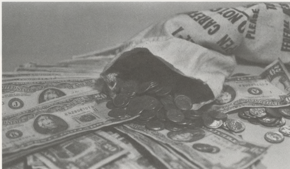
Ordering cash is made easier through the RESPONSE network.

The RESPONSE network provides fast and efficient access to such Fed services as receiving reserve statement information, transferring securities, sending and receiving funds transfers, and receiving ceiling rate information for money market CDs, in addition to the new currency and coin ordering option. The network, which was introduced in the spring of 1982, has been successful in increasing on-line participation. At the end of 1982, 226 financial institutions were on-line with the Dallas Fed through one of three available options.