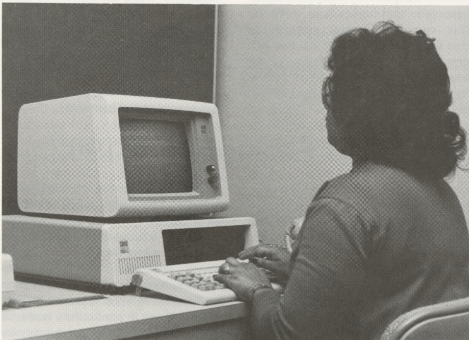
The IBM Personal Computer provides access to Fed services and other functions.

In addition to the new dial-connect terminal, the Dallas Fed offers several other alternatives for institutions seeking online access. These include a direct link between the institution's computer and the Fed's computer, which is designed for high-volume users of Fed Services, and direct links between various configurations of terminals, keyboards and printers with the Fed's computer, which are designed for moderate-volume users of Fed services.