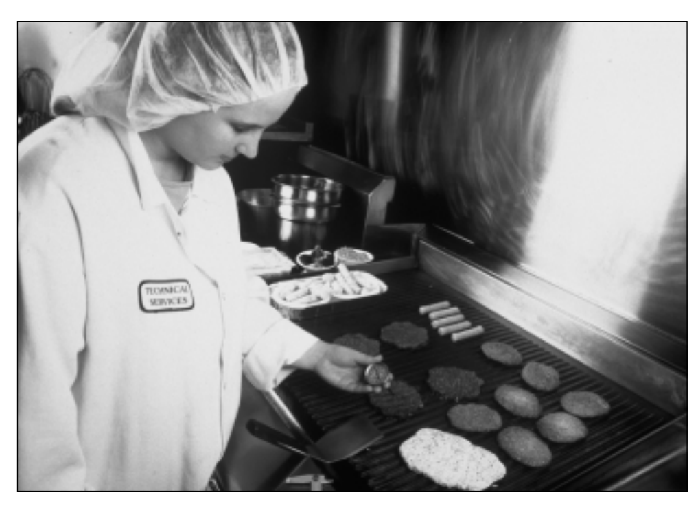
An employee of Siméus Foods International tests the temperature of meats the company will sell to restaurants nationwide.

To sum up, we think Congress made a wise decision 30 years ago when it turned the job of expanding home ownership over to an active secondary market by establishing Fannie Mae as a private, shareholder-owned company. As our mission statement says, "At Fannie Mae we are in the American dream business. Our mission is to tear down barriers, lower costs and increase opportunities for home ownership and affordable rental housing for all Americans, because having a safe place to call home strengthens families, communities and our nation as a whole."