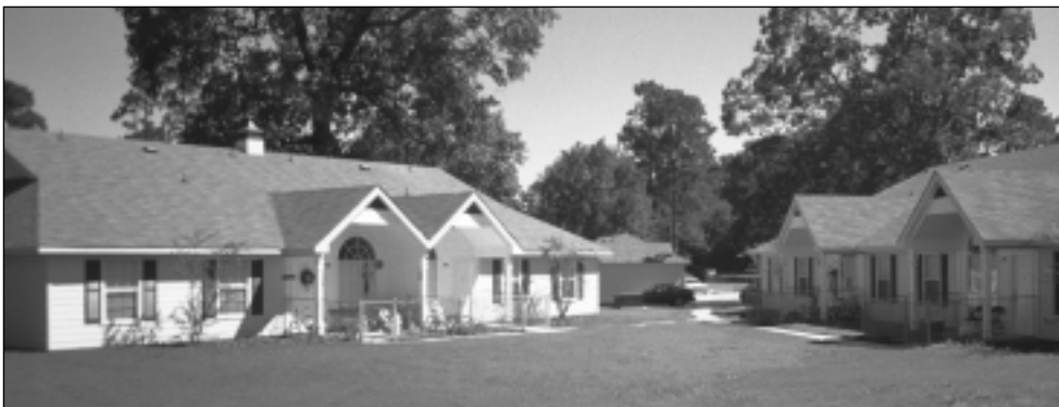
Using tax credits, developers can provide affordable rental housing like these attractive homes in Dayton Park, Dayton, Texas.