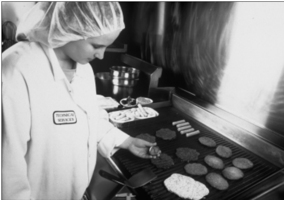
An employee of Siméus Foods International tests the temperature of meats the company will sell to restaurants nationwide.

To sum up, we think Congress made a wise decision 30 years ago when it turned the job of expanding home ownership over to an active secondary market by establishing Fannie Mae as a private, shareholder-owned company. As our mission statement says, "At Fannie Mae we are in the American dream business. Our mission is to tear down barriers, lower costs and increase opportunities for home ownership and affordable rental housing for all Americans, because having a safe place to call home strengthens families, communities and our nation as a whole." ▀