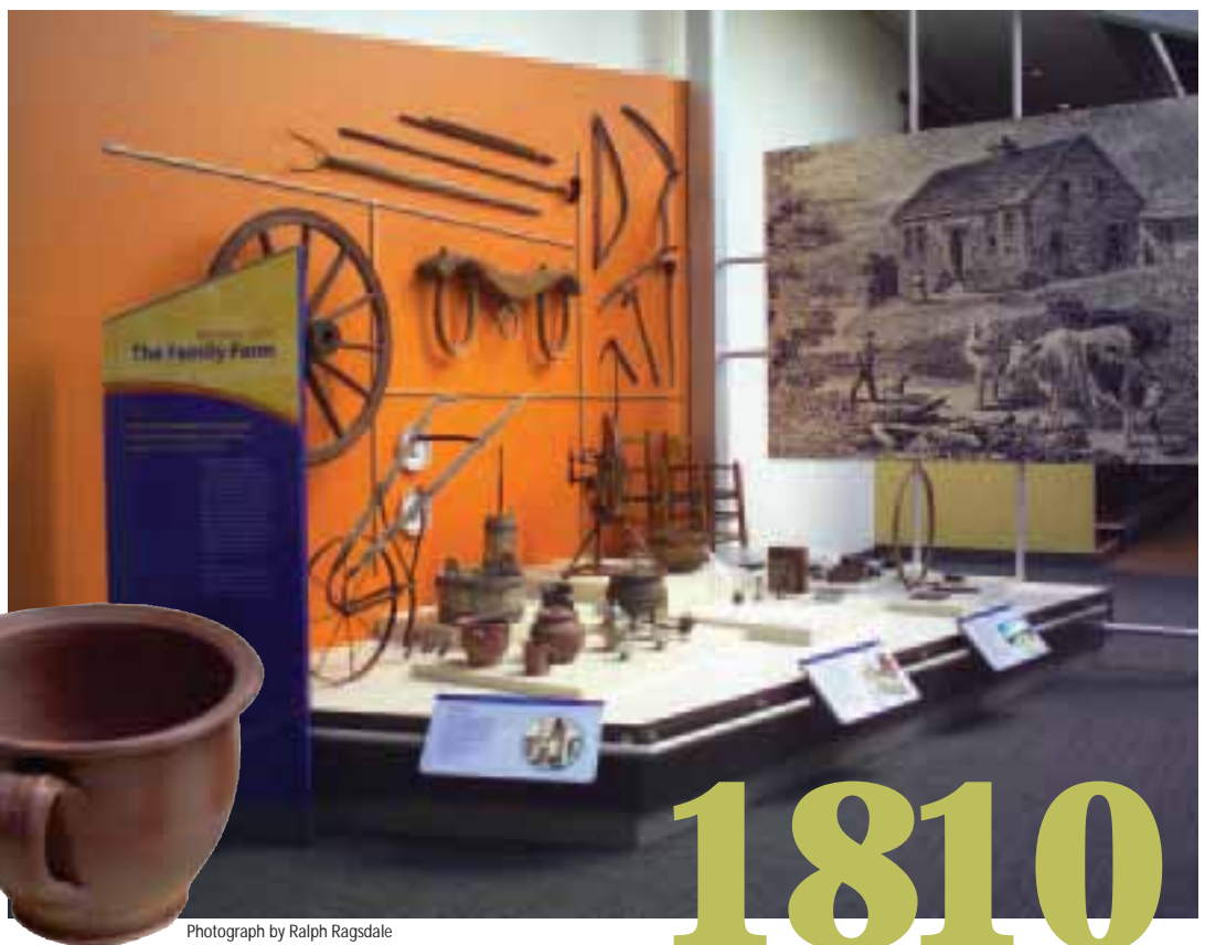
Photograph by Ralph Ragsdale

You can see evidence of these changes in the 1890s display. Most of the items are factory-made, and, in contrast with 1810, many of the items are frills — a parlor organ, the complete works of Sir Walter Scott, an artificial bird in a cage, sheet music, toy coin banks — items that made life more pleasant for people who had a bit more money and spare time than their