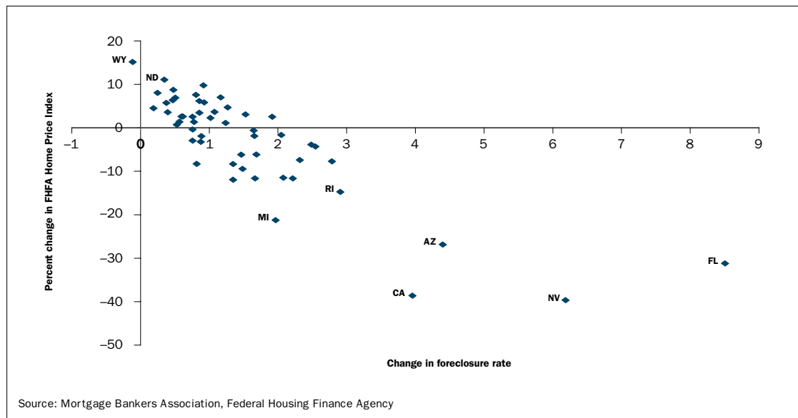
Figure 3 Change in foreclosure rate and FHFA House Price Index by state, 2006Q1–2008Q4

lot size, the square footage and age of the home, and the number of bedrooms and bathrooms) and neighborhood characteristics. Notably, studies vary significantly in their coverage of property and neighborhood features—with the latter often simply proxied for using location indicators like ZIP code. Nevertheless, if one thought these property and neighborhood characteristics were well controlled for, any statistically and economically significant foreclosure discount could then presumably be ascribed to differences in property quality or liquidity. Note that, to date, there has been only limited investigation seeking to identify these two effects separately.