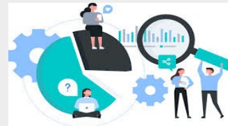
Consumer payments research