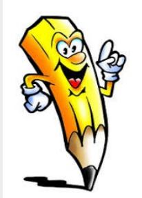
Take On Payments blog