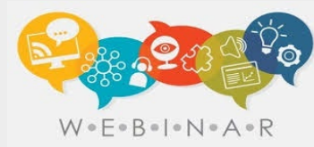
Talk About Payments webinars