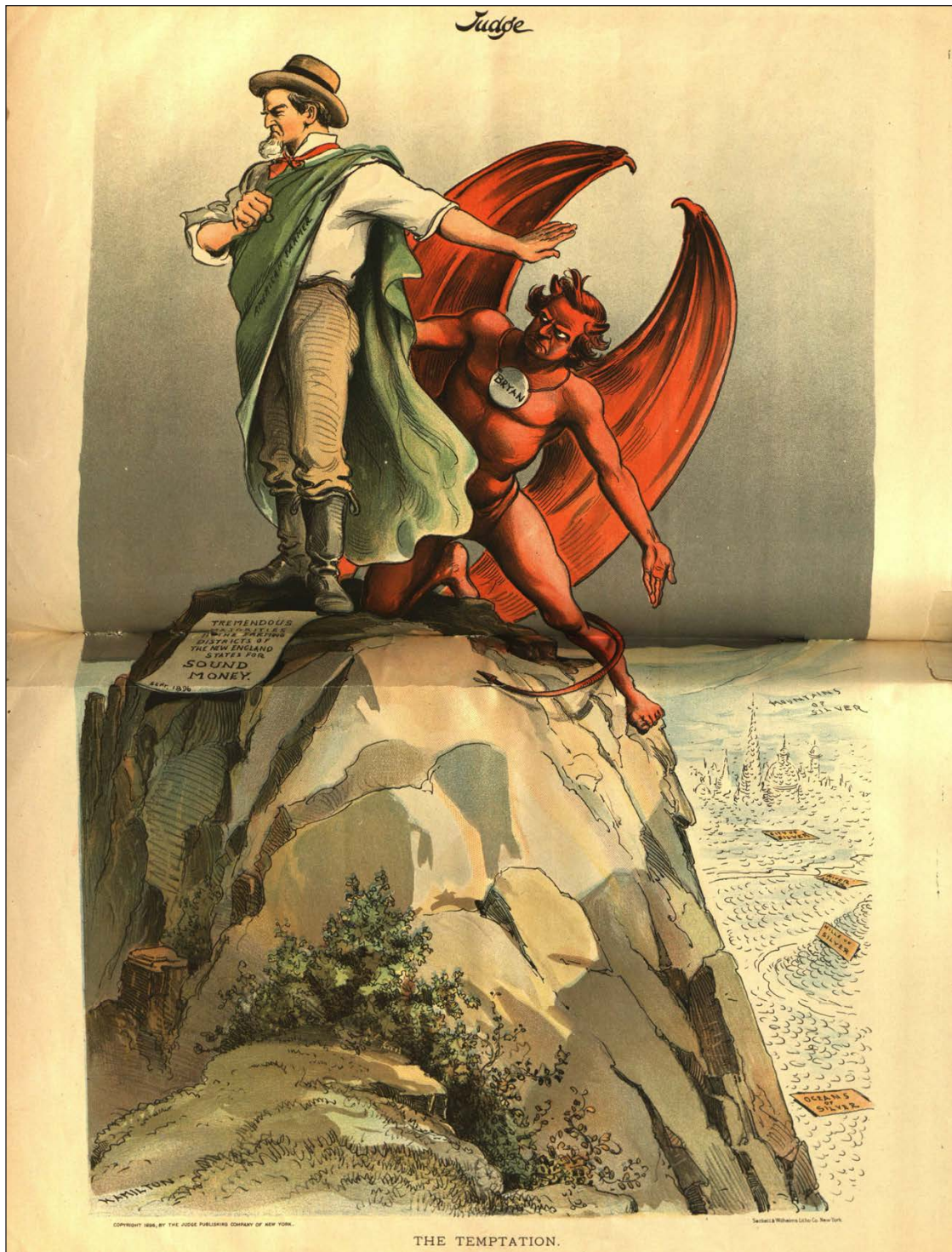
Judge. New York: Judge Publishing Company, 1896; https://fraser.stlouisfed.org/archival/1342/item/458992?start_page=12 .