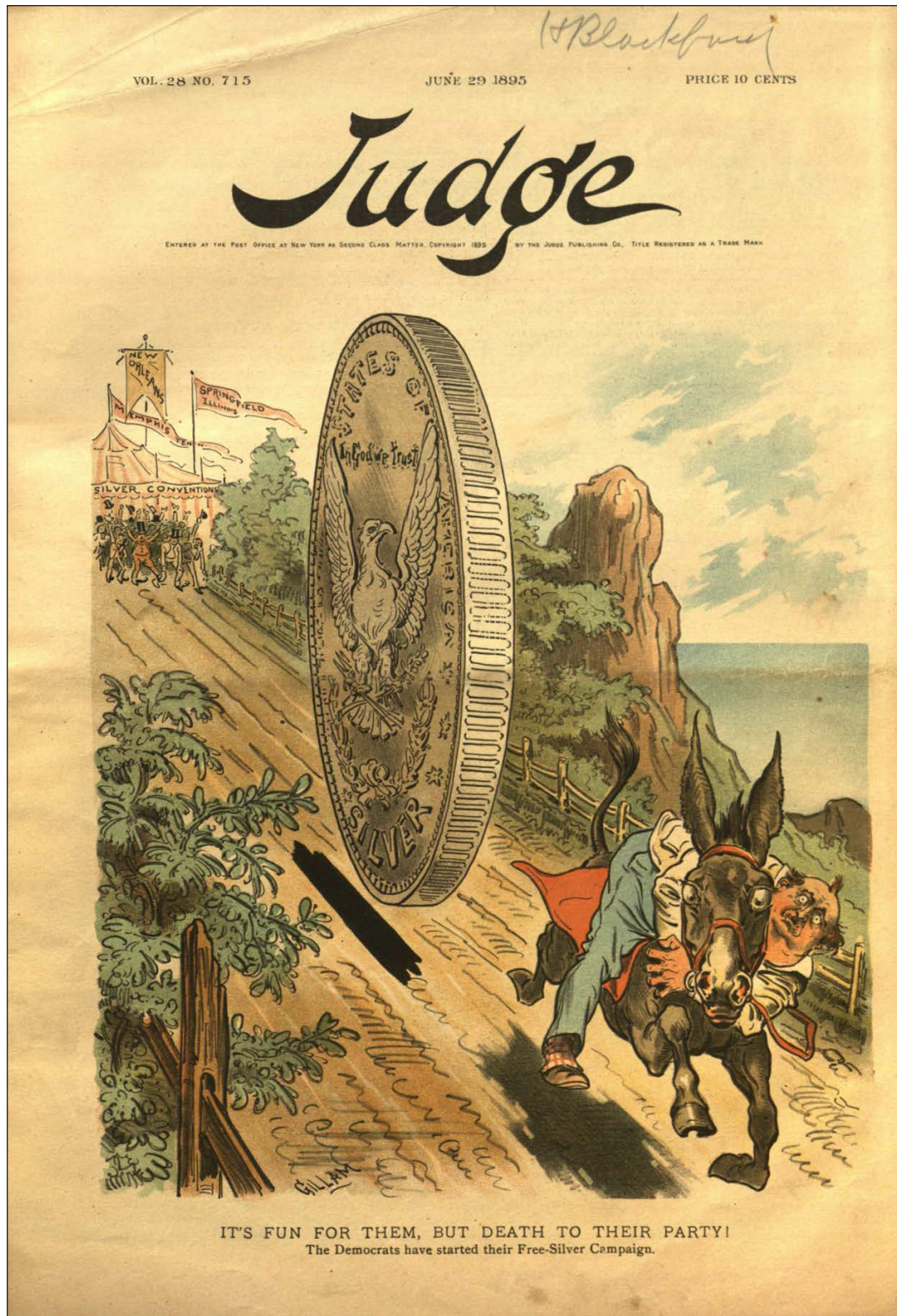
Judge. New York: Judge Publishing Company, 1895; https://fraser.stlouisfed.org/archival/1342/item/458992?start_page=5 .