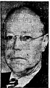
Robert A. Taft

Less than nine hours after President Truman delivered his message on European aid and domestic price controls, Sen. Robert A. Taft of Ohio, Chairman of the Senate Republican Policy Committee, at 10 p.m. (EST), Nov. 18, made a radio address in which he expressed general approval of emergency financial aid to Western European countries and thus prevents spread of communism, but voiced strong opposition to the President's proposals to combat inflation through restoration of wartime economic controls.