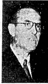
W. Averell Harriman

I appreciate the opportunity to appear before this committee today to state my views on one of the most important questions now faced by our country—the problem of whether and to what extent we shall assist in the economic recovery of western Europe. Secretary