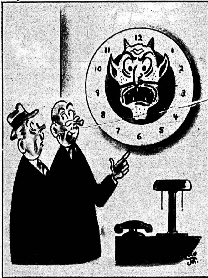
"It's my own idea—keeps my employees from watching the clock!"

anti-trust laws. The other was the subject of industrial capacity—whether it is large enough. These studies have been delayed for "months" as a direct result of the Council's pre-occupation with foreign aid. The Council cannot come up with recommendations in time for Congressional action in 1948.