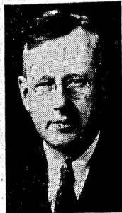
Alf M. Landon

This does not mean that there is not a food shortage in Europe. Within the cities there is a food shortage beyond any doubt, and this will continue to be the case as long as there is a currency situation which makes those who raise