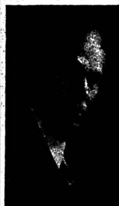
George C. Marshall

The American people, I believe, have a sound understanding of the basic principles and objectives of our foreign policy. These have been expressed on many occasions by responsible officials of the government beginning with the President. They are under-