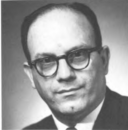
Ben Burdetsky, Acting Commissioner, 1968-69 and 1973