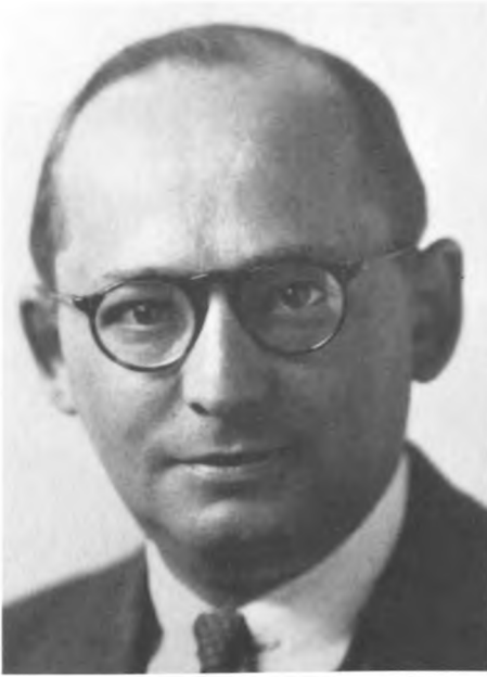
Isador Lubin, Commissioner, 1933-46