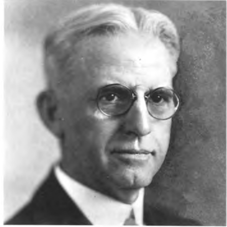
Charles E. Baldwin, Acting Commissioner, 1932-33