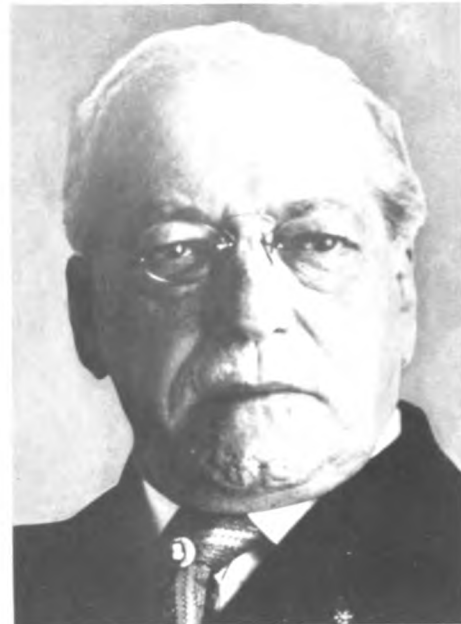
Samuel Gompers, president of the American Federation of Labor, counseled with and supported the Bureau while leading the fight to establish the Department of Labor.