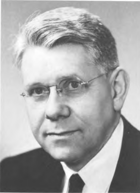
Ewan Clague, Commissioner, 1946-65