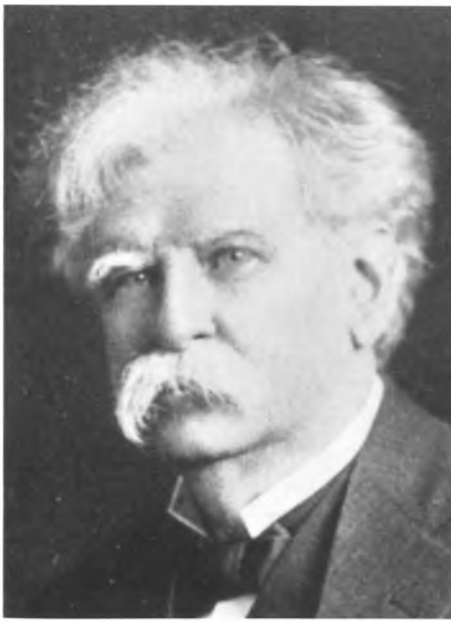
Ethelbert Stewart, Commissioner, 1920-32