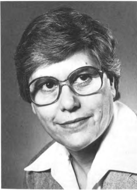
Janet L. Norwood, Acting Commissioner and Commissioner, 1978 to present

Norwood presents economic data to Joint Economic Committee.