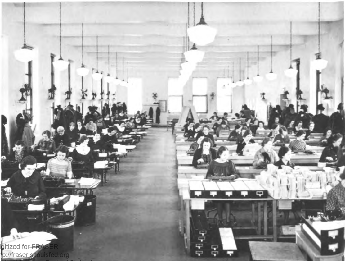
BLS tabulating room, about 1935