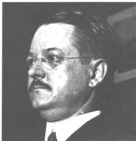
G.W.W. Hanger, Acting Commissioner, 1913