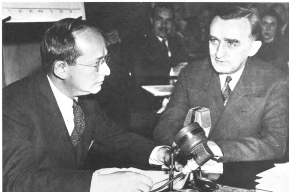
Lubin and Senator O'Mahoney opening hearings of Temporary National Economic Committee, 1938