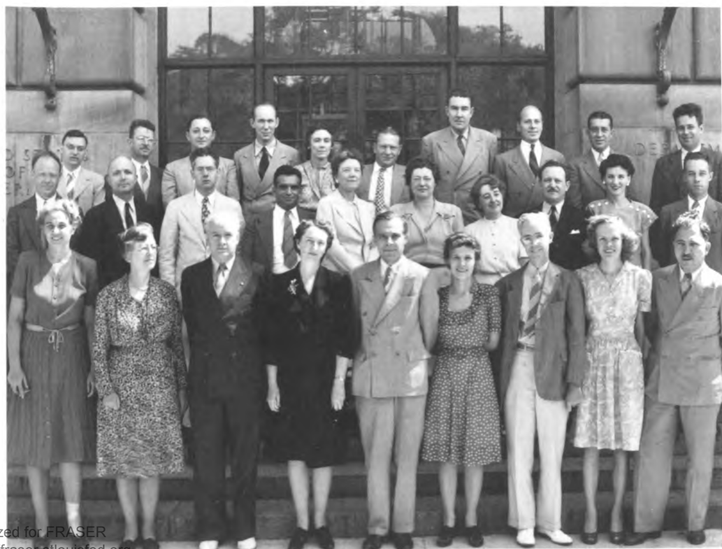
Top BLS staff, July 1946