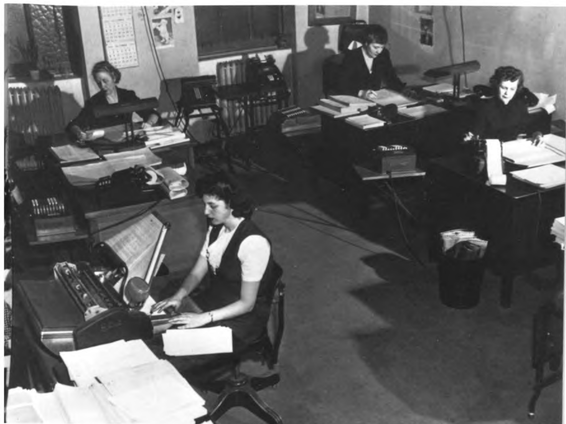
BLS tabulating room, 1950's