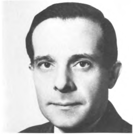
A. Ford Hinrichs, Acting Commissioner, 1940-46