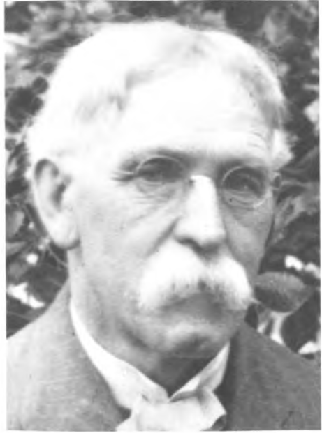
Terence V. Powderly, as Grand Master Workman of the Knights of Labor, campaigned for establishment of a national bureau and sought the post of Commissioner.