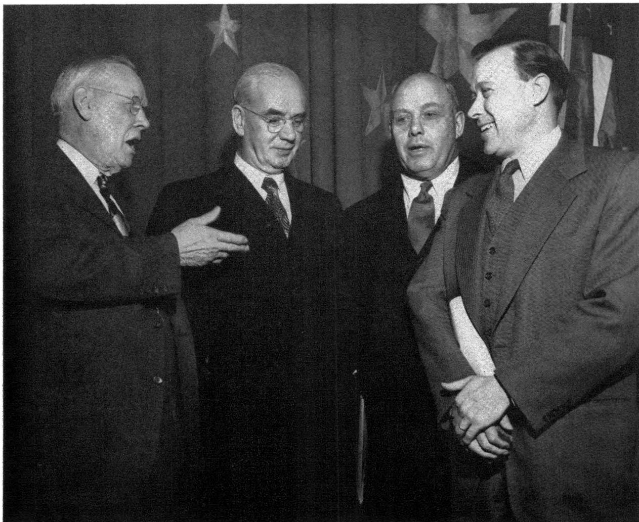
William Green, 1870–1952, president American Federation of Labor, 1924–52