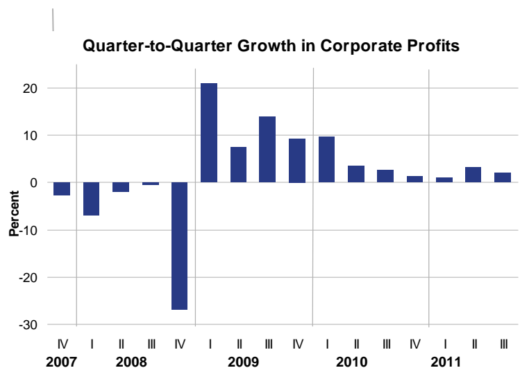
Corporate profits growth is measured as the percent change from the previous quarter.

Nonfinancial profits rose 1.6 percent, and financial profits rose 3.8 percent. Profits from the rest of the world increased 1.4 percent.