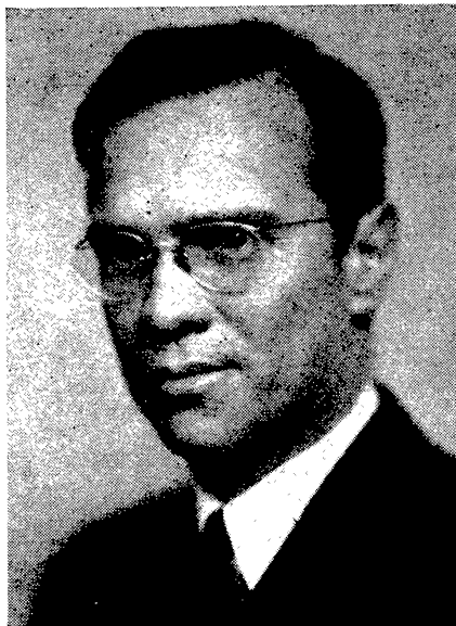
WILLIAM McC. MARTIN, JR. Chairman, Export-Import Bank

We have recently negotiated a financial agreement with Great Britain which it is my sincere hope Congress will adopt and thus rechannel the flow of world trade which was dammed up when this nation, a