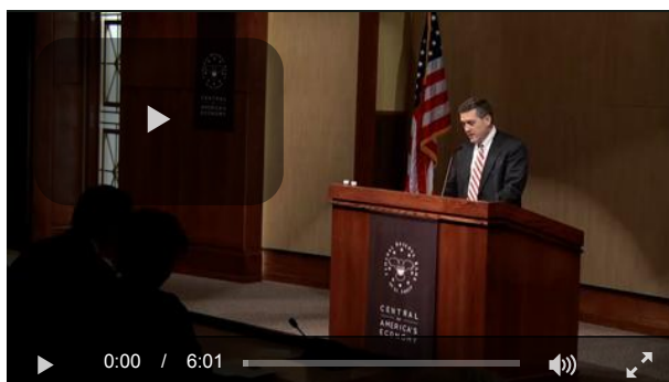
James Bullard, Opening Remarks Axel Weber, "Challenges for monetary policy in EMU"

Bundesbank President Axel Weber discussed the financial crisis and its lessons for monetary policy in a lecture at the St. Louis Fed. Weber, a member of the Governing Council of the European Central Bank, also talked about economic governance reform in the euro area. Weber was here for the annual Homer Jones Memorial Lecture, named for a former research director of the St. Louis Fed. President James Bullard gave opening remarks .