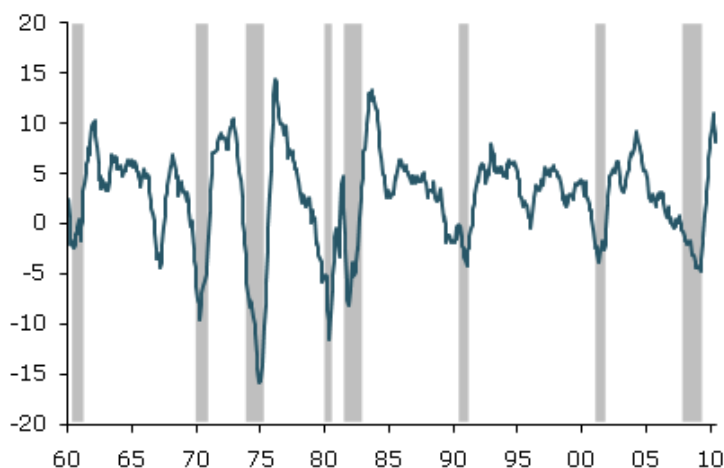
Figure 1 The Leading Economic Index (LEI)

Note: Gray bands denote NBER recessions.