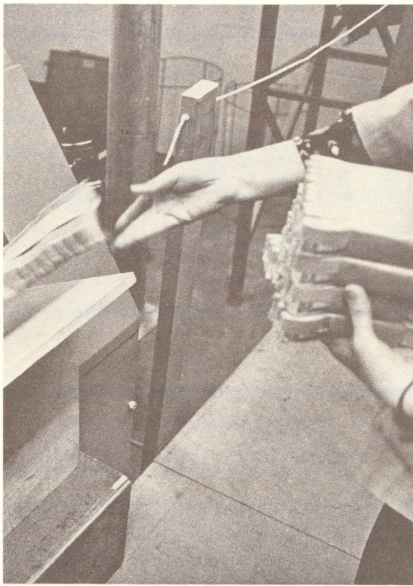
Money to burn