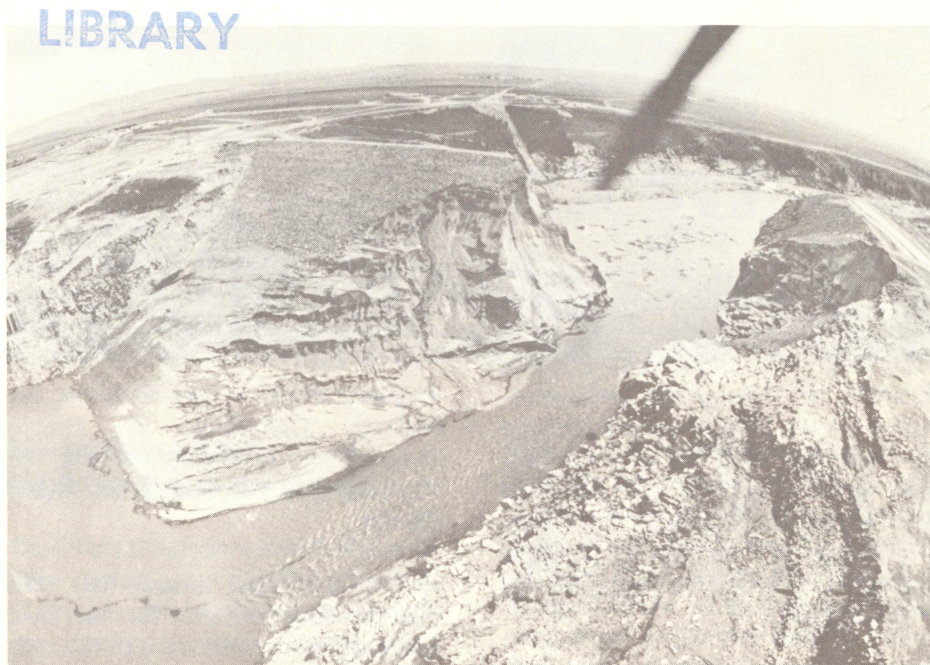
An aerial view of the remains of Teton Dam two days after the break. At this point the water level in the broken dam and the Snake River are equal. The earth-filled dam, as high as a 30-story building, released a wall of water that forced 30,000 persons to flee their homes.

The Federal Reserve Bank of San Francisco contacted the Board of Governors immediately after the disaster to suggest the waiving of Regulation Q penalties for the early re-