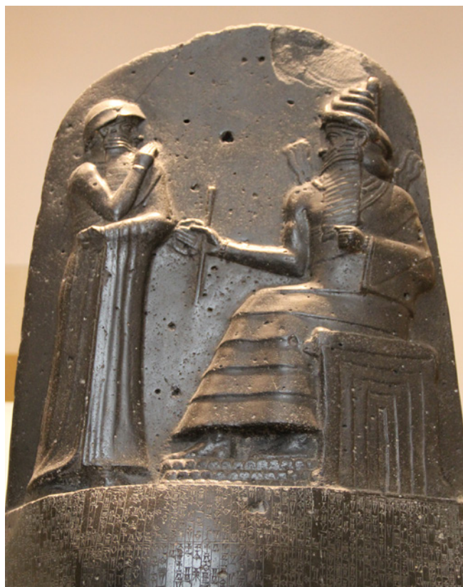
Debt forgiveness was practiced in ancient Mesopotamia. The Laws of Hammurabi, seen here, laid out situations in which debt slates could be wiped clean, such as if "a storm prostrates the grain, or the harvest fail, or the grain does not grow for lack of water; in that year he need not give his creditor any grain."