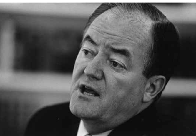
Hubert H. Humphrey