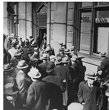
Many Americans lost their entire savings when more than 6,500 banks failed between 1929 and 1933.

Congress also passed the Banking Act of 1933, which established the Federal Deposit Insurance Corporation to insure consumers' bank deposits. The Securities Exchange Act of 1934 created the Securities and Exchange Commission (SEC). This law, together with the Securities Act of 1933, was designed to restore investor confidence in U.S. capital markets. Congress also gave the Federal Reserve Board more central authority in the Banking Act of 1935, which determined that the FOMC should include the seven-member Board of Governors as well as the Reserve Bank presidents.