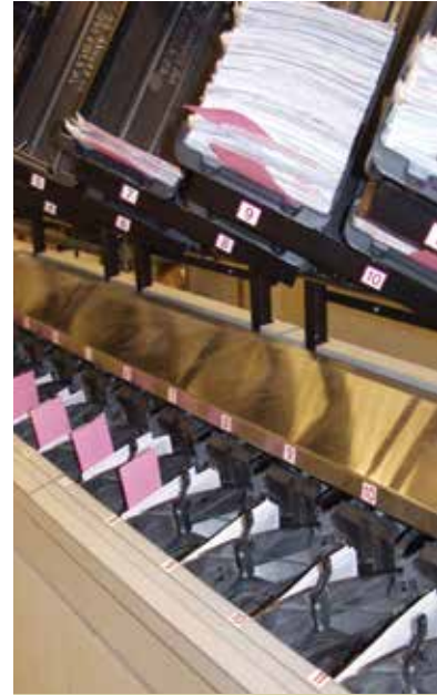
As the Fed moves to processing checks electronically, it will need fewer high-speed check sorters such as this one.

The modern-day Fed reflects the lessons of history and the demands of a rapidly changing economic and financial system.