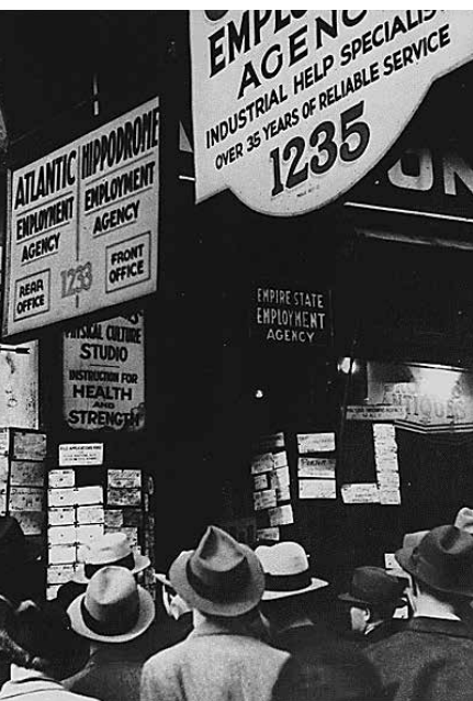
During the Depression many Americans were unemployed and looking for jobs.