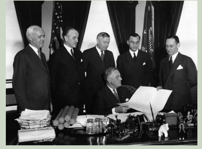
President Roosevelt signs the Banking Act of 1933

open market operations were becoming the main tool for carrying out monetary policy, overtaking another of the Fed's monetary policy tools: changes in the discount rate.