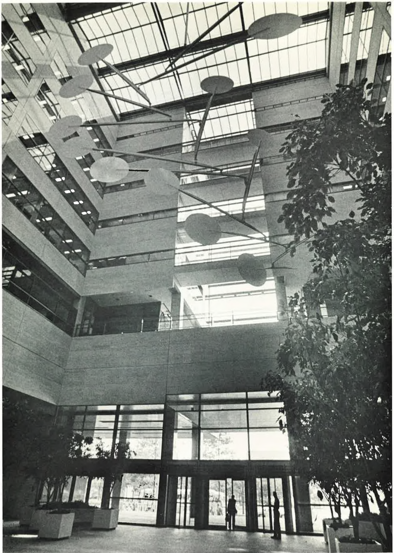
East Court – New Building