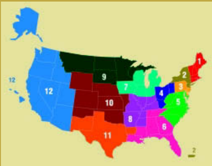
The 12 Federal Reserve Districts

The Fed receives no government funding, paying instead for its activities with interest earned from investments in government securities, loans to banks and charges for services provided to financial institutions.