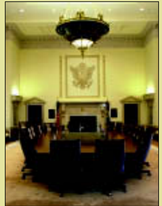
Meeting room of FOMC in Washington, D.C.

The committee makes decisions that affect the amount of available money and credit. For example, if the FOMC sees signs of inflationary pressures that may affect price stability, the committee may move to slow the growth of the money supply.