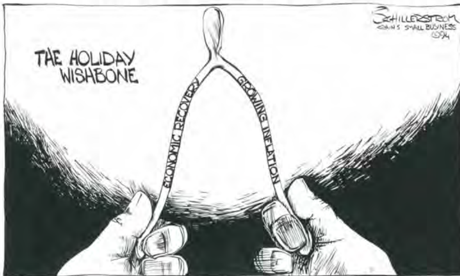
ROGER SCHILLERSTROM, CRAIN COMMUNICATIONS INC. REPRINTED WITH PERMISSION.

The mistaken belief that growth causes inflation stems in part from confusion about real growth and nominal growth. Real growth is an increase in the physical volume of goods and services produced. Nominal growth, on the other hand, is an increase in the dollar value of output, whether that rise involves greater real output, a higher price level, or both. If nominal growth exceeds real growth, inflation is occurring. However, achieving price stability does not require less real growth. Instead, it requires that spending does not persistently rise faster than the rate of real growth. Central bank actions to combat inflation are not intended to limit real output growth, but to prevent nominal growth that would result in a rising price level. For a further discussion of misperceptions surrounding growth and inflation, see "No Trade-off" on page 8.