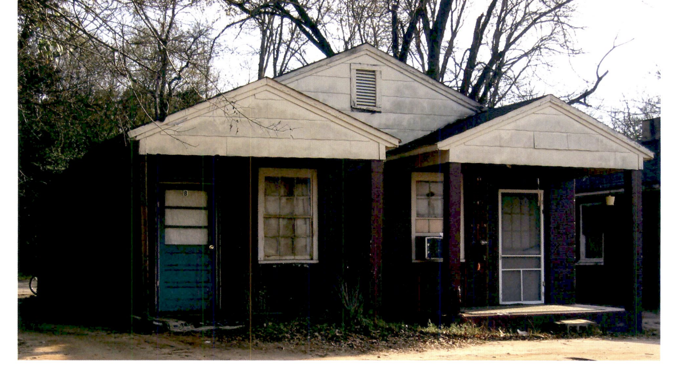
More than one-third of East Albany households own their homes (compared to 61.8 percent for the larger Albany area), but community leaders are concerned that many of the units are in need of rehabilitation. Greater Second Mt. Olive Baptist Church is responding to this need by renovating 300 housing units on an old military base to provide new homeownership opportunities. The church is the only community housing development organization (CHDO) active in East Albany, and it is the primary recipient of the city's HOME funding, a federal block grant to create affordable housing.

higher crime rates, both physical and mental health problems, extra costs for public services and reduced fiscal capacity, as well as political and societal divisions. In addition they determined what circumstances influenced the capacity to address these issues constructively to bring about lasting improvements.