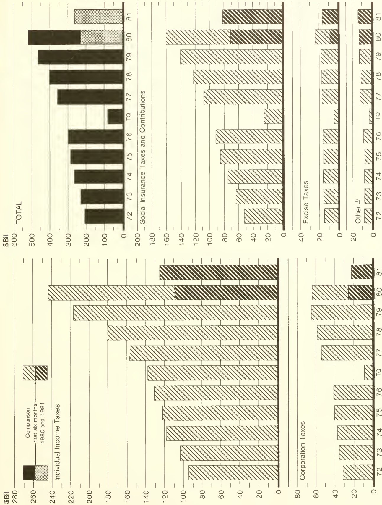
For actual amounts see preceding Table FFO-2.